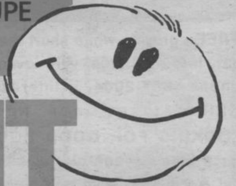
• NEW SPORTS COUPE