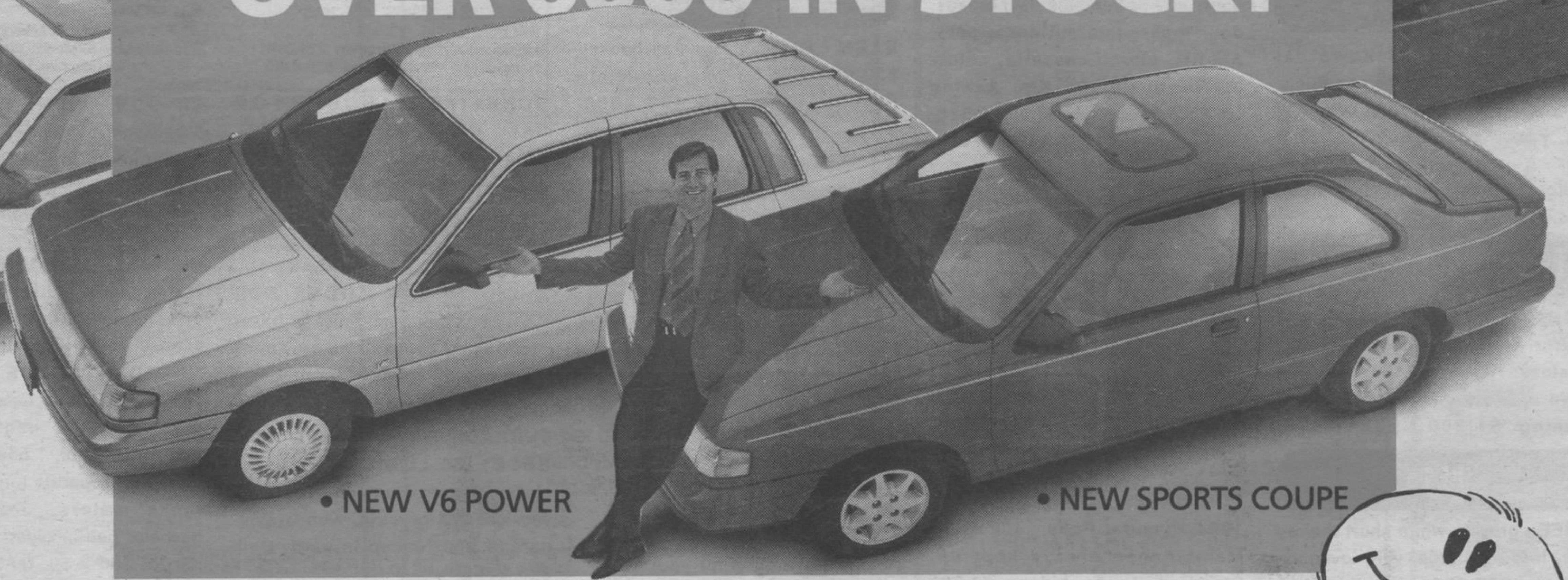
• NEW V6 POWER

$1,000+ NO CHARGE CASHBACK AIR CONDITIONING OR 7.9% FINANCING* OR AUTOMATIC TRANSMISSION OVER 6000 IN STOCK!