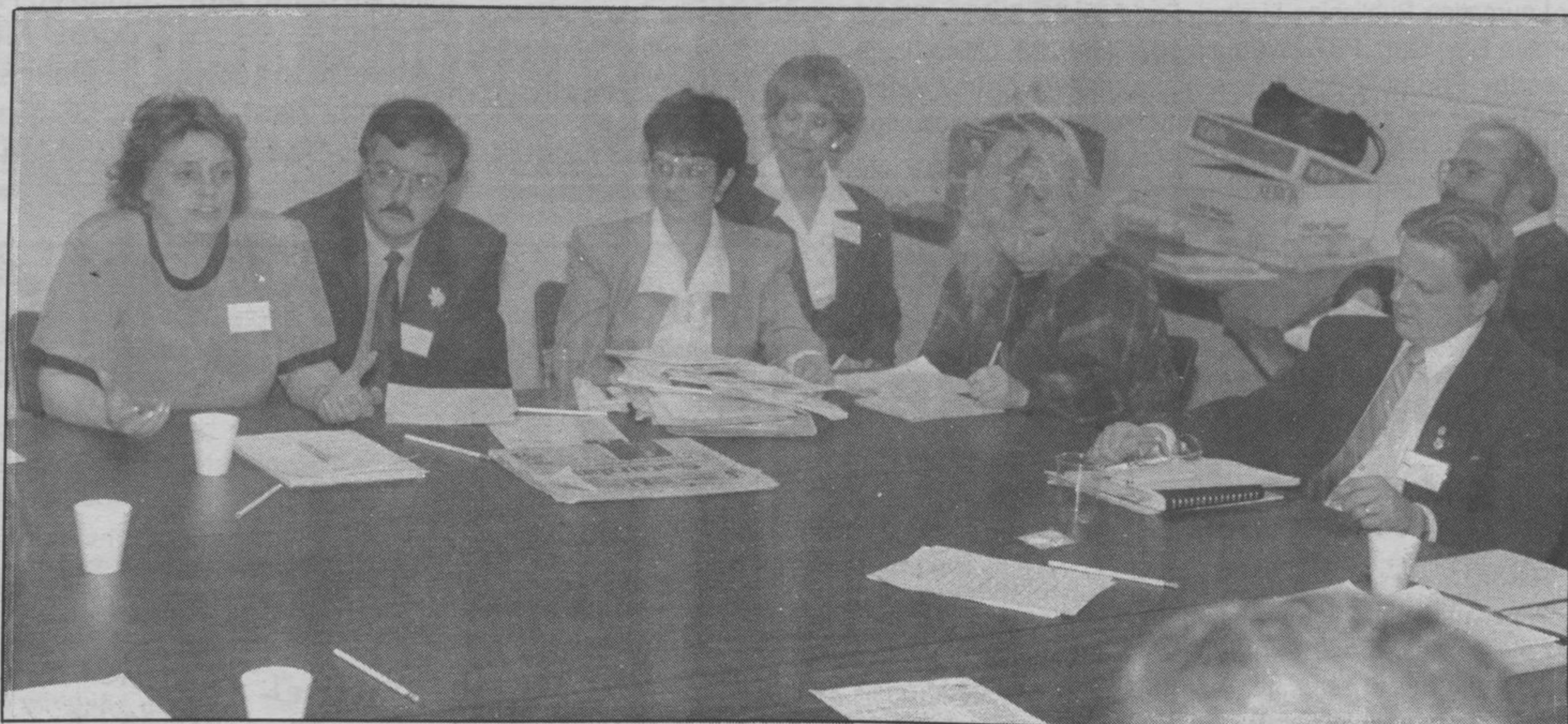
Round table discussions at last week end's meetings.