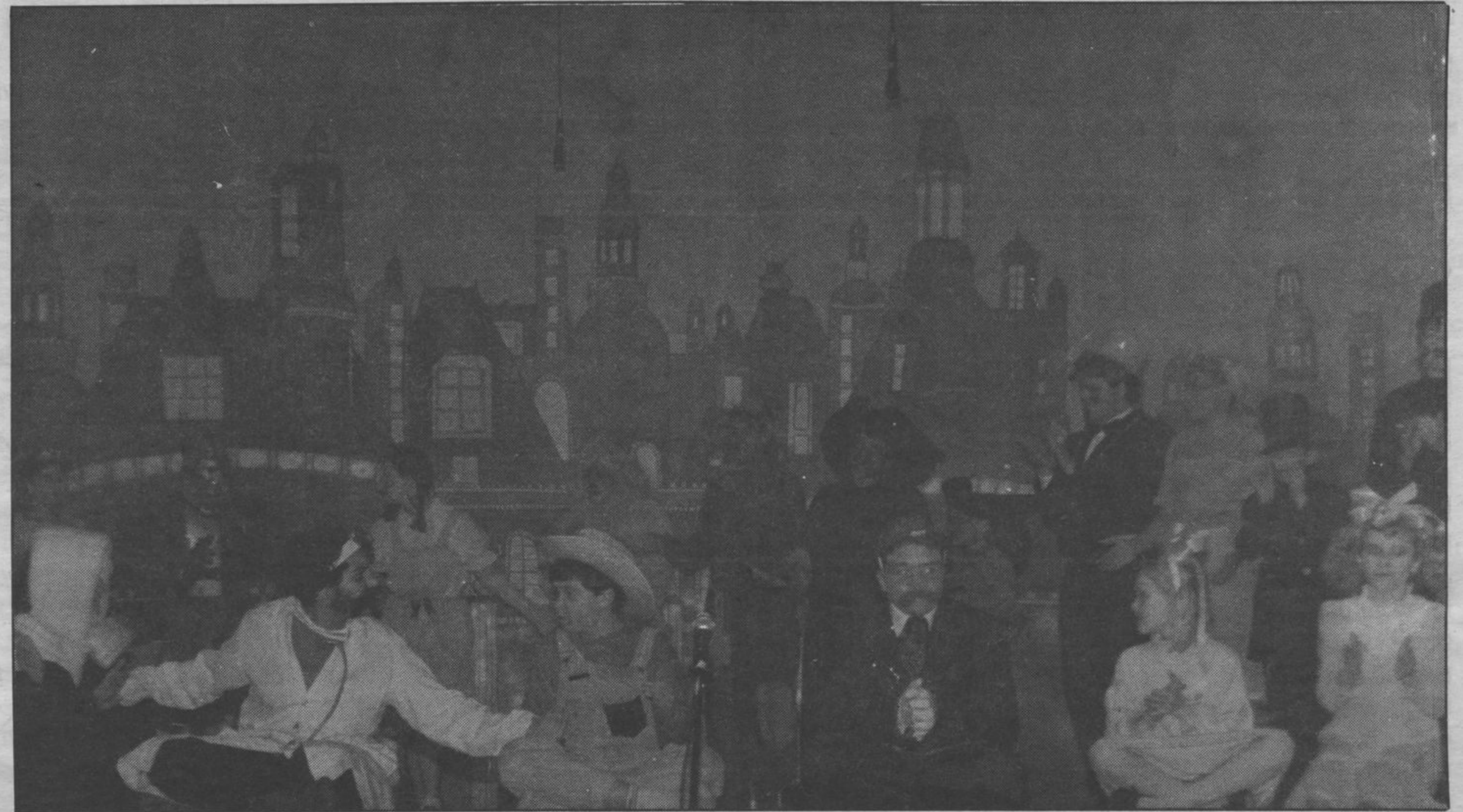
The performers take a well deserved bow after Sunday night's performance at Lake Superior High School. The standing room only crowd gave them a standing ovation.