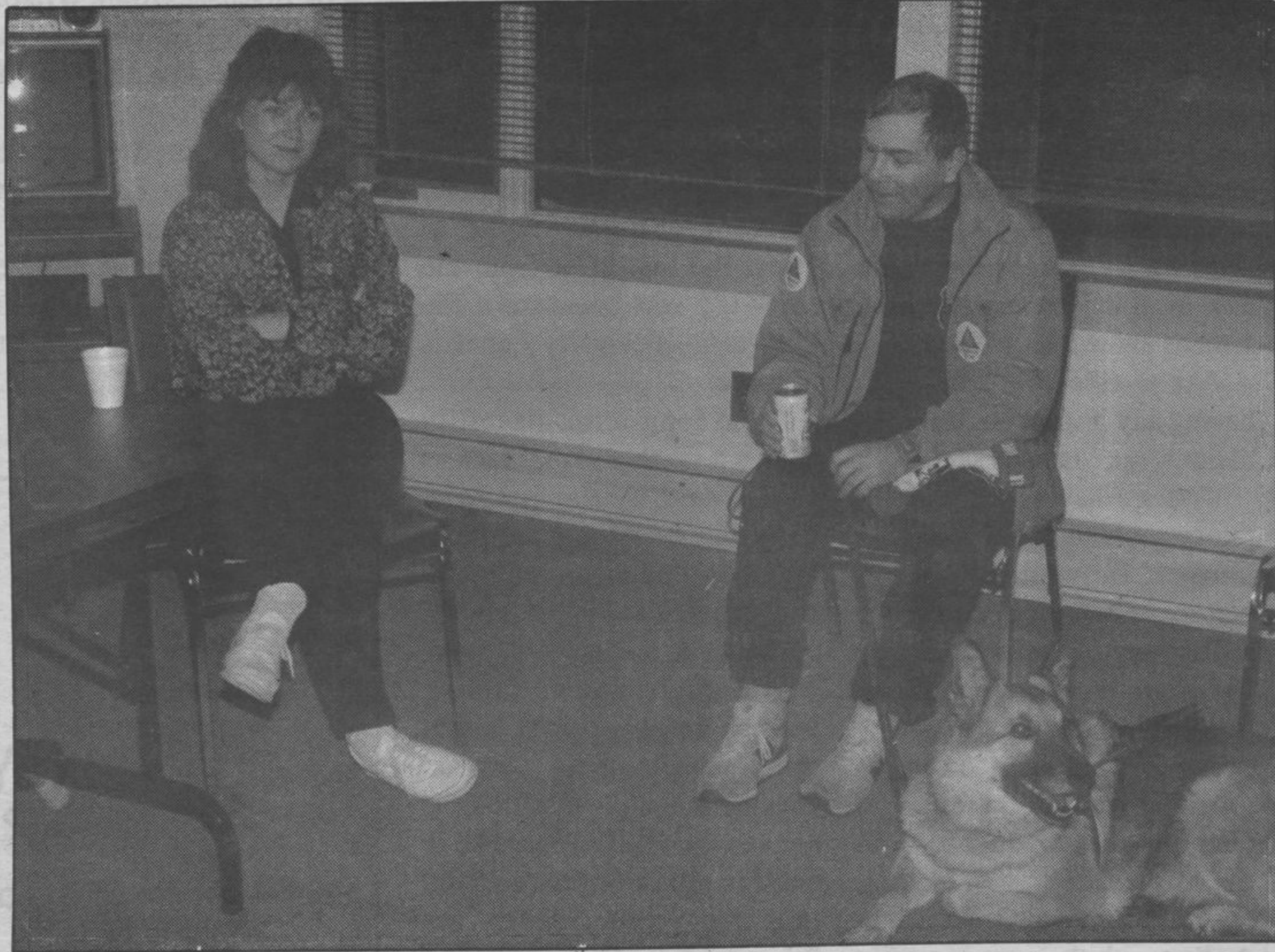
Since there's a bit of extra room in the paper this week, we have a chance to run some of the better photographs that didn't quite make it into the paper last month, because there wasn't enough room.