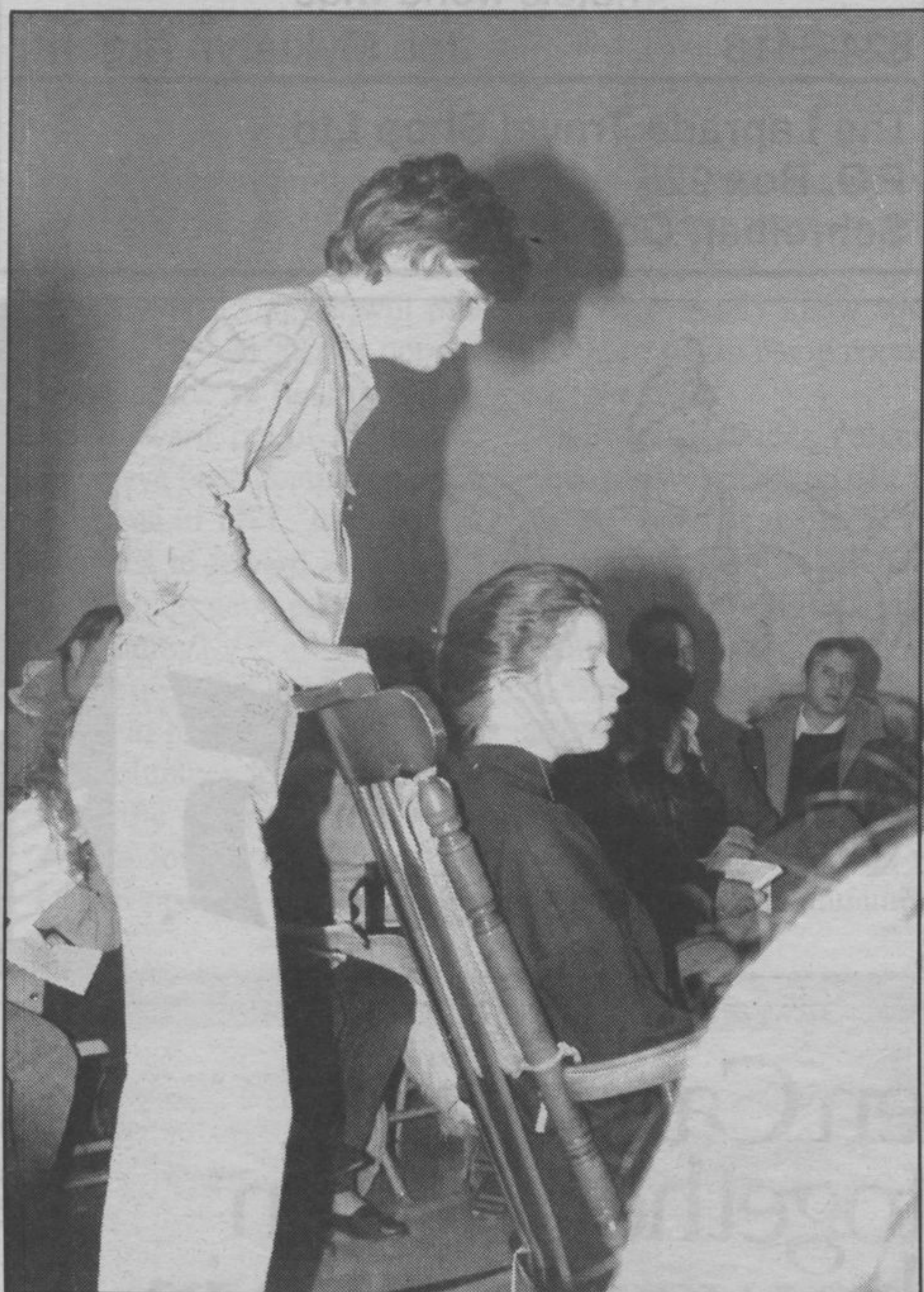
Students perform three one act plays last week-end— The People Versus Christ , Do , and An Overpraised Season . It was Schreiber's first ever theatre in the round performance