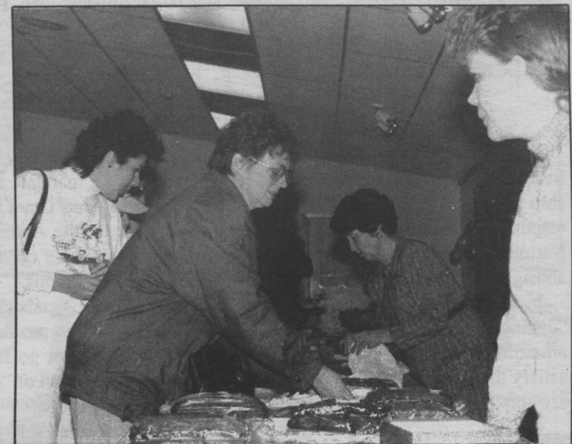
This young man seems unimpressed by the hustle and bustle going on around him during the Tea and Bazaar at the Royal Canadian Legion Branch #109 in Schreiber last Saturday afternoon. About 100 people attended the event.