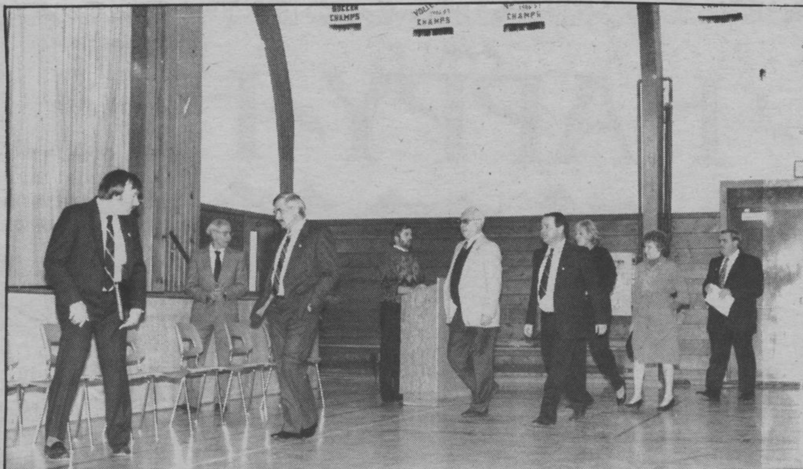
Would be Councillors and Trustees take their seats last week.