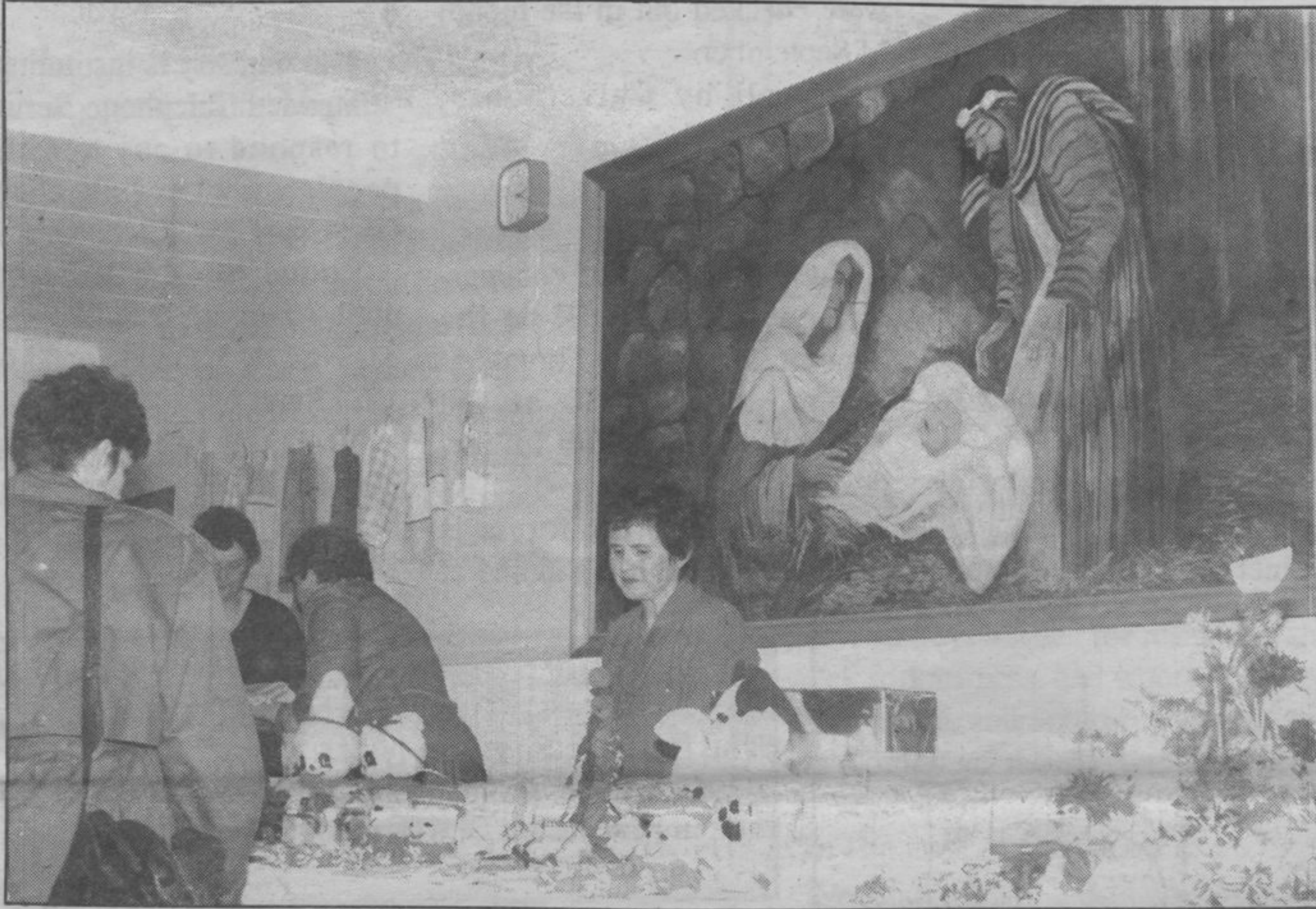
It was standing room only at the Community Church last week, as people lined up to buy everything from sweets to sweaters during the Church's annual Bazaar. They were a rush of people into the hall when the doors opened at 2 pm, but things eventually settled down enough for people to have a little tea.