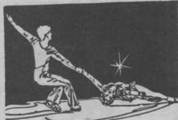
FIGURE SKATING CHEESE DRIVE:

Starting the week of Oct. 27 the Schreiber Figure Skating Club will be