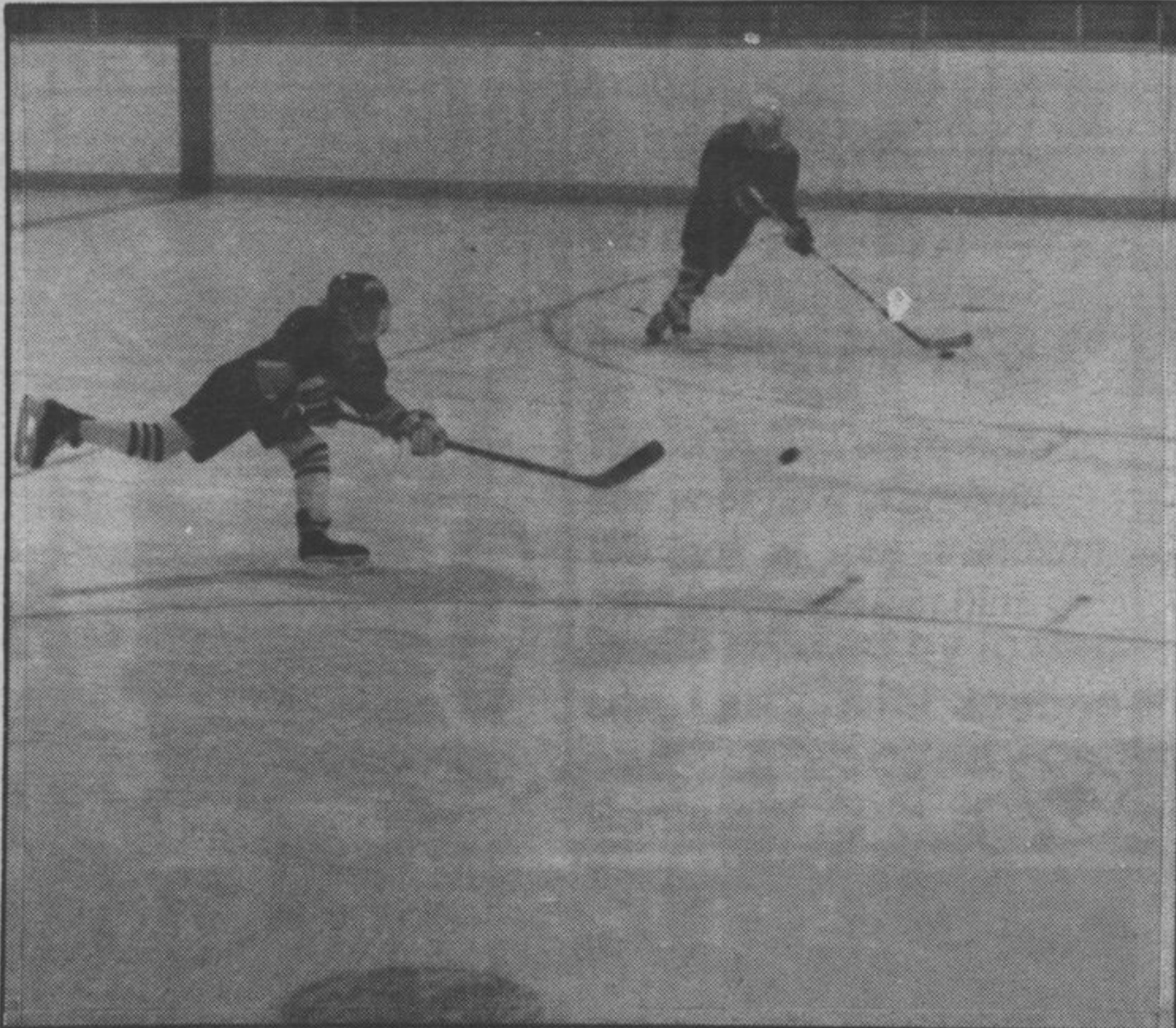
But let's hope not, personality-wise anyway. This Mario in the making took part in a pre-season minor hockey school last week at the Terrace Bay arena.