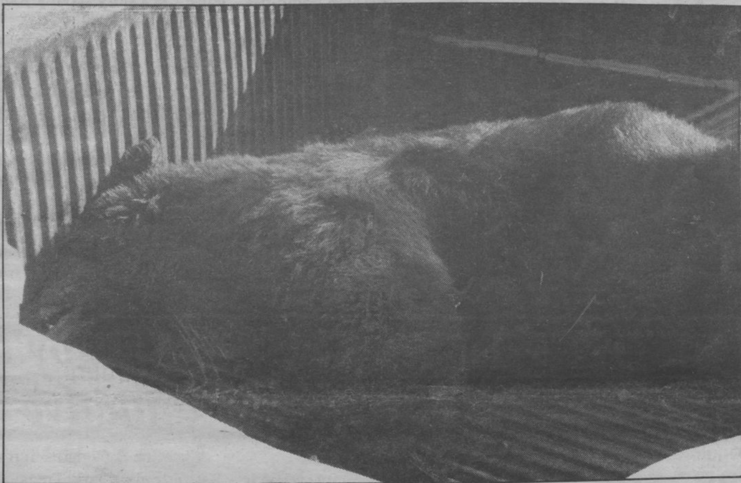
Terrace Bay police are asking residents to keep their garbage indoors for the next couple of weeks, so it doesn't attract anymore bears into the area. They hope to prevent this from happening again.