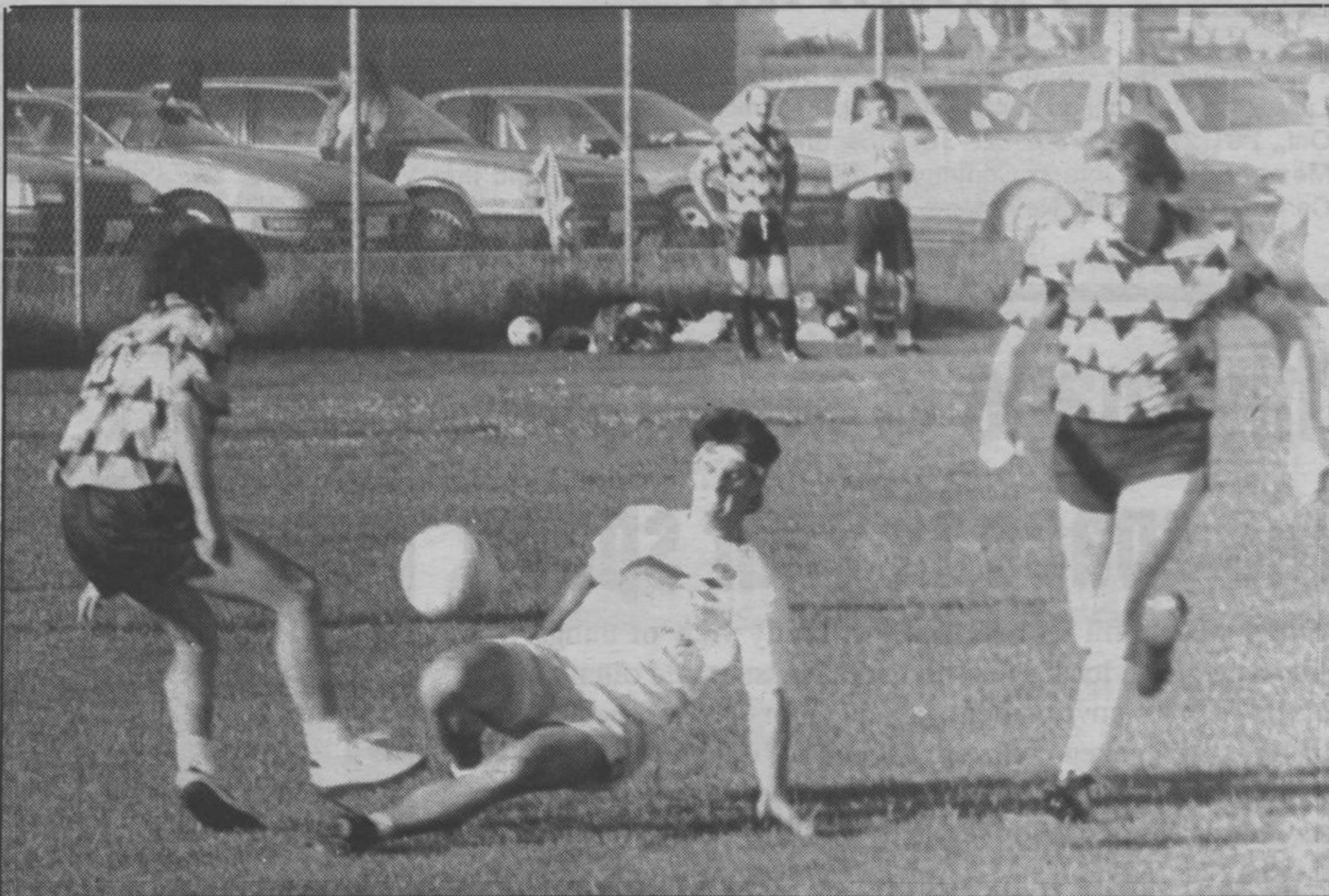
A hard landing after a heroic effort

The car wash will take place at the Norwood Motel parking lot between 3 - 6 p.m.