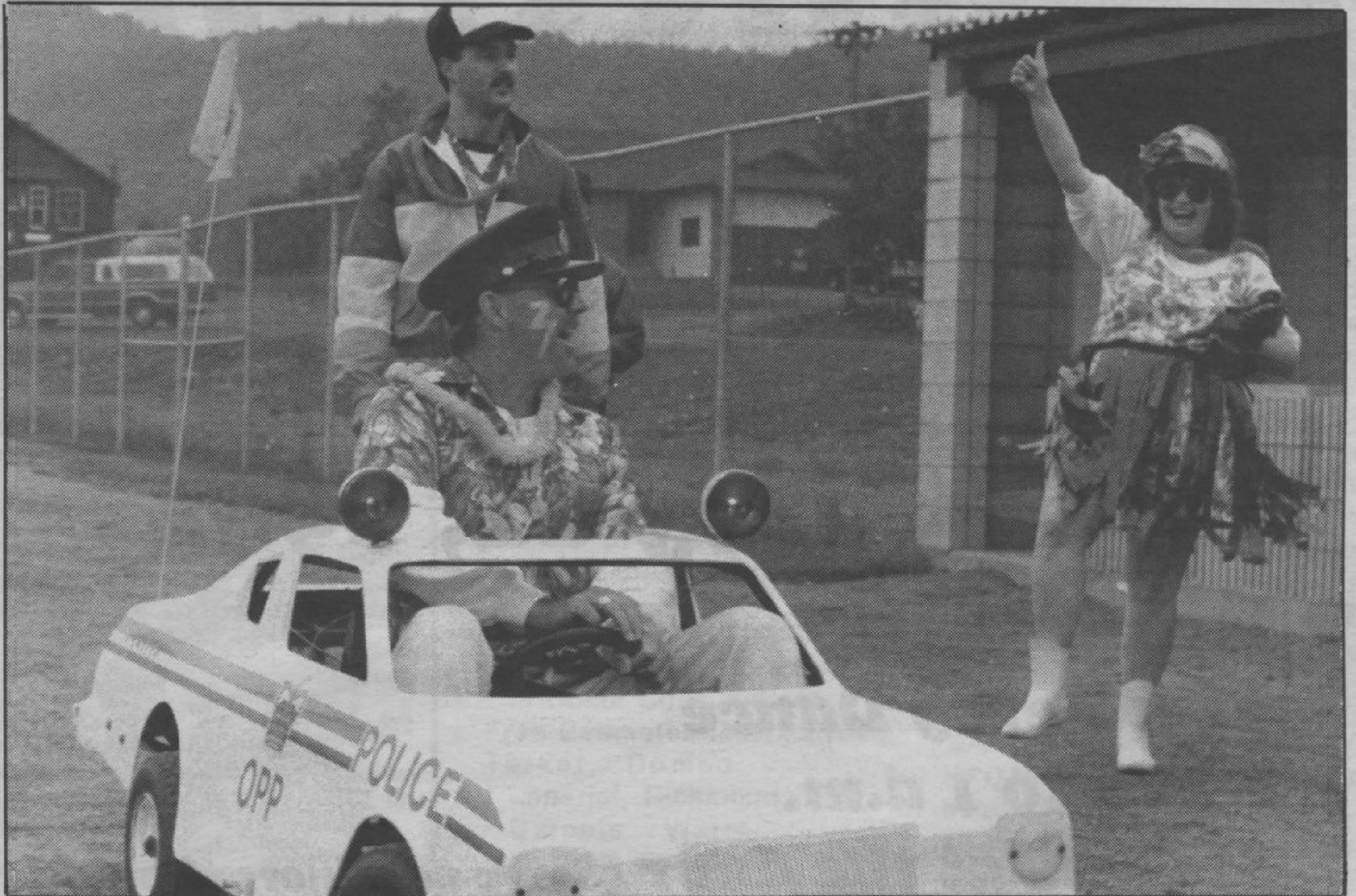
The newest OPP cruiser was on hand to cheer on the Cops on the Beach team.