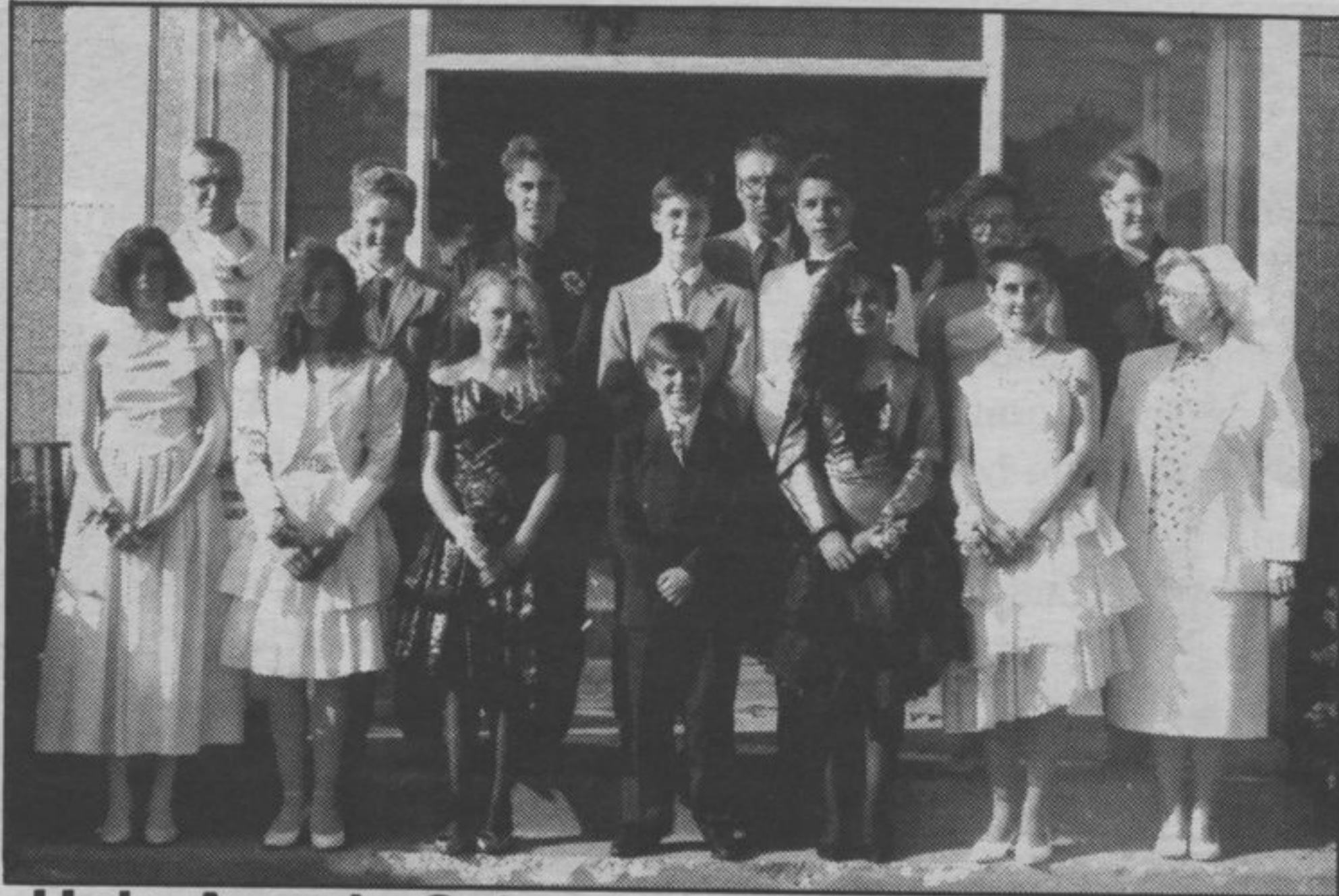
Holy Angels School graduating class 1991