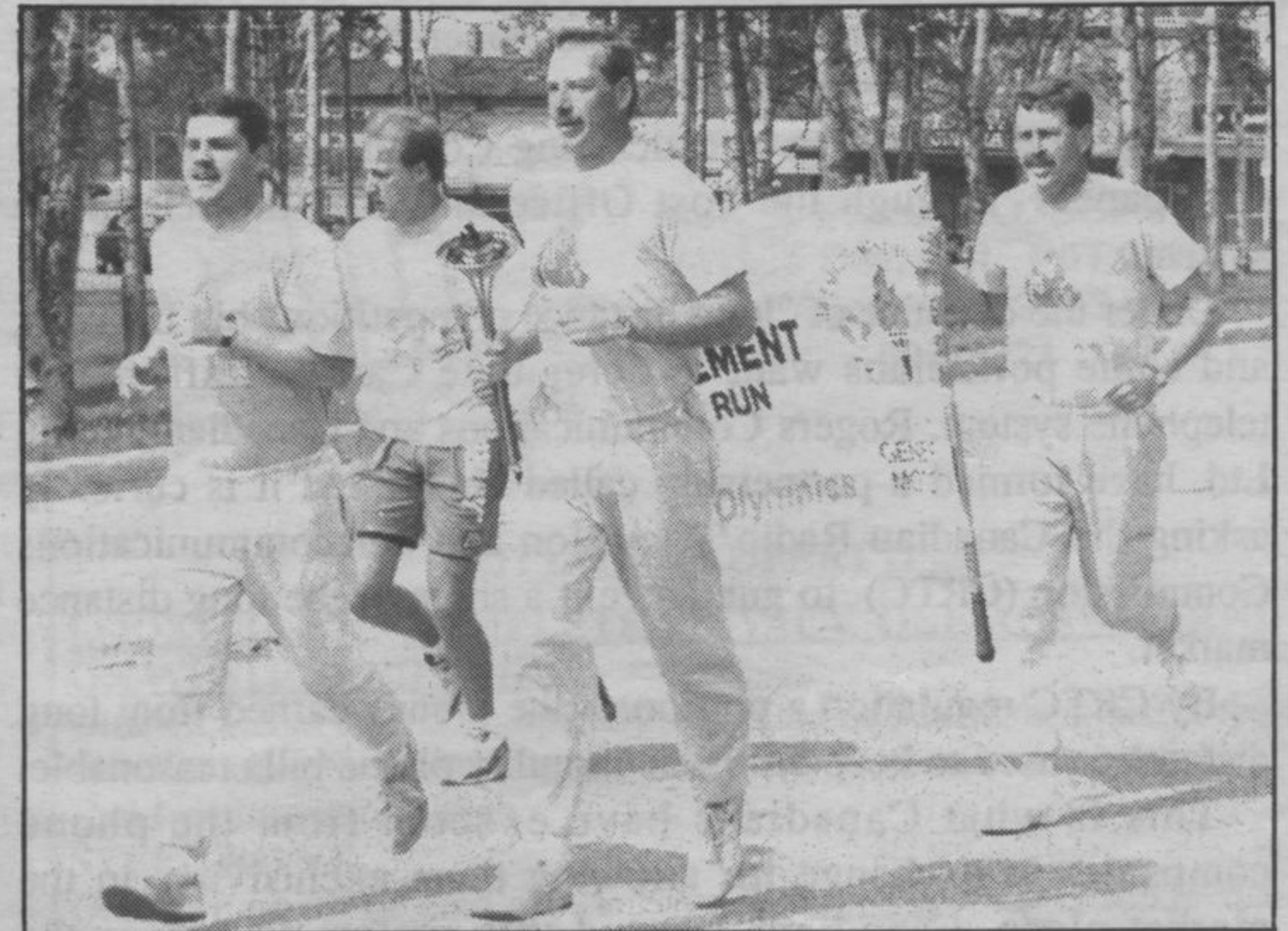
Runners for the Terrace Bay Police Services and the Ministry of Natural Resources picked up the Torch for their run at 11 a.m. Sunday, June 9.