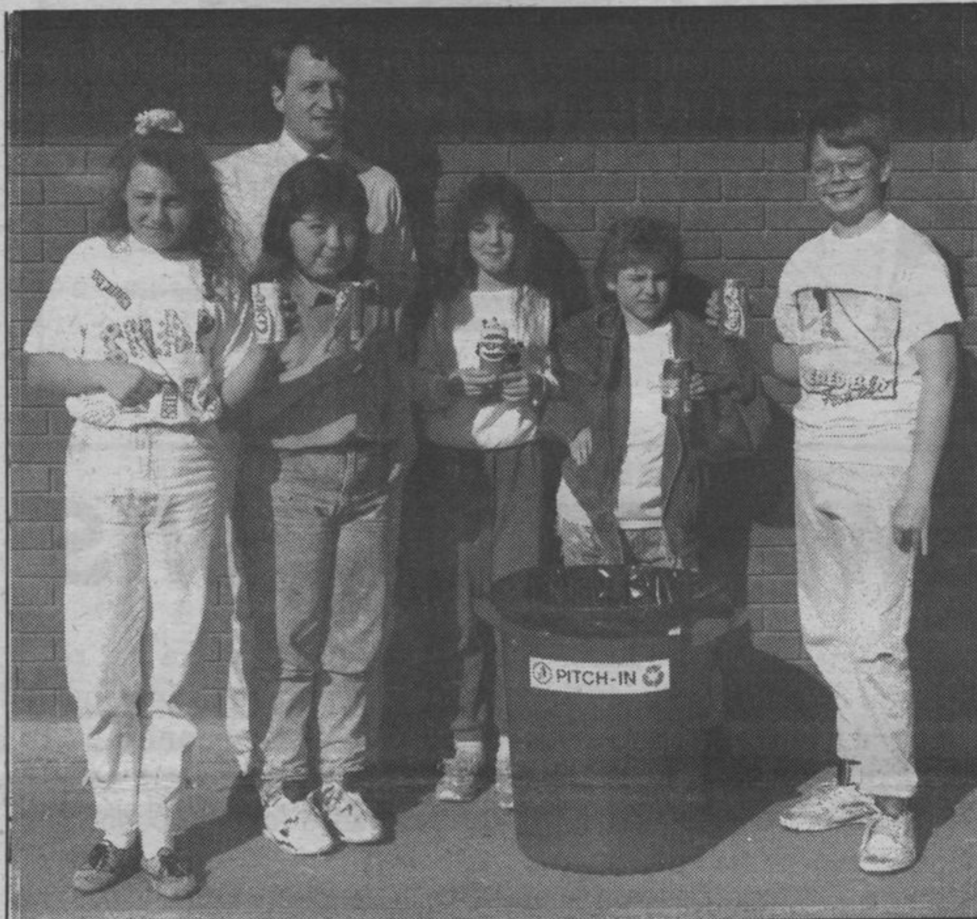
Members of the Schreiber Public School Enviro Club around the Pitch-in container used at the school to collect pop cans for recycling.

Club members are also working with all of the students promoting the idea of a garbageless lunch. Ideally the students would bring their lunch in a reusable bag and, rather than wrap their food in plastic it would be placed in reusable air tight containers.