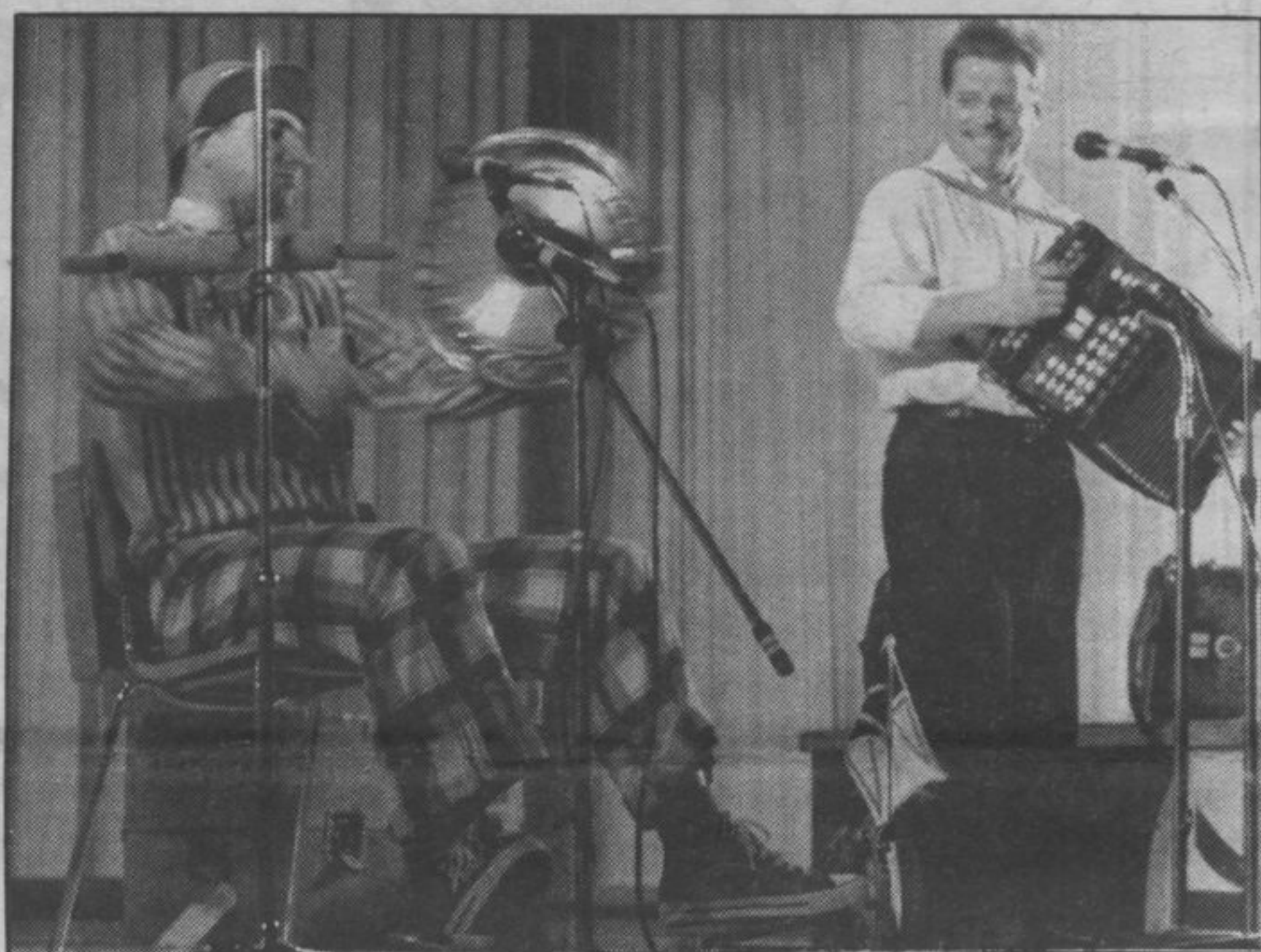
Buddy and the other Other Feller