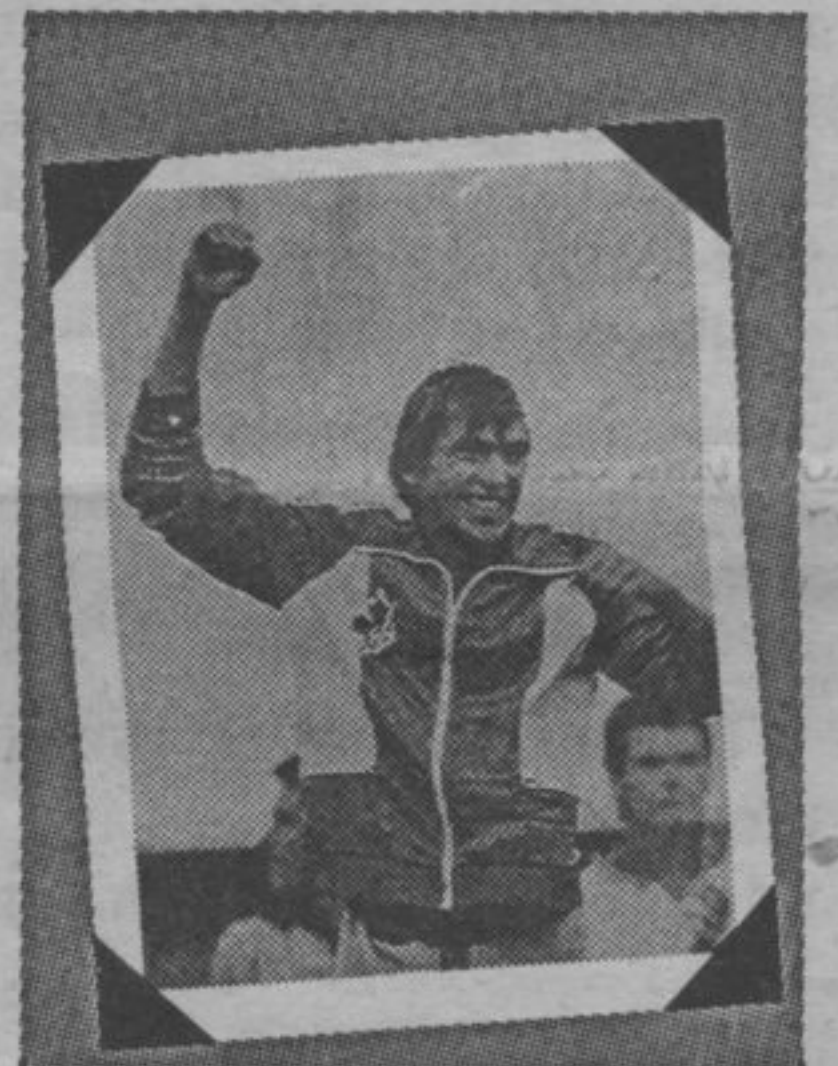
Dave Steen, Bronze Medal, Decathlon, Seoul Olympics, 1988