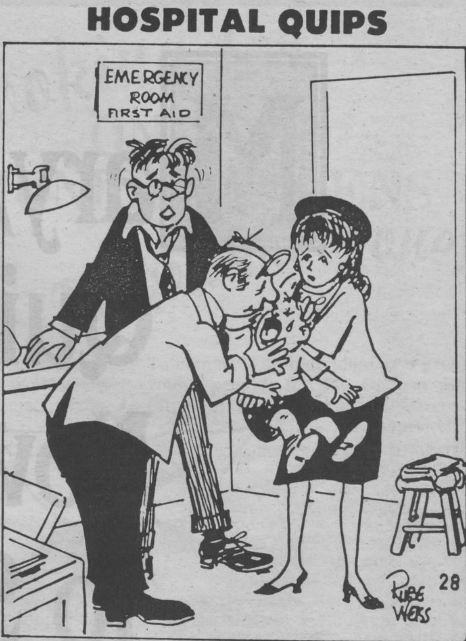
"A TINY LITTLE ASPIRIN HE CAN'T SWALLOW; A KENNEDY HALF DOLLAR HE CAN."