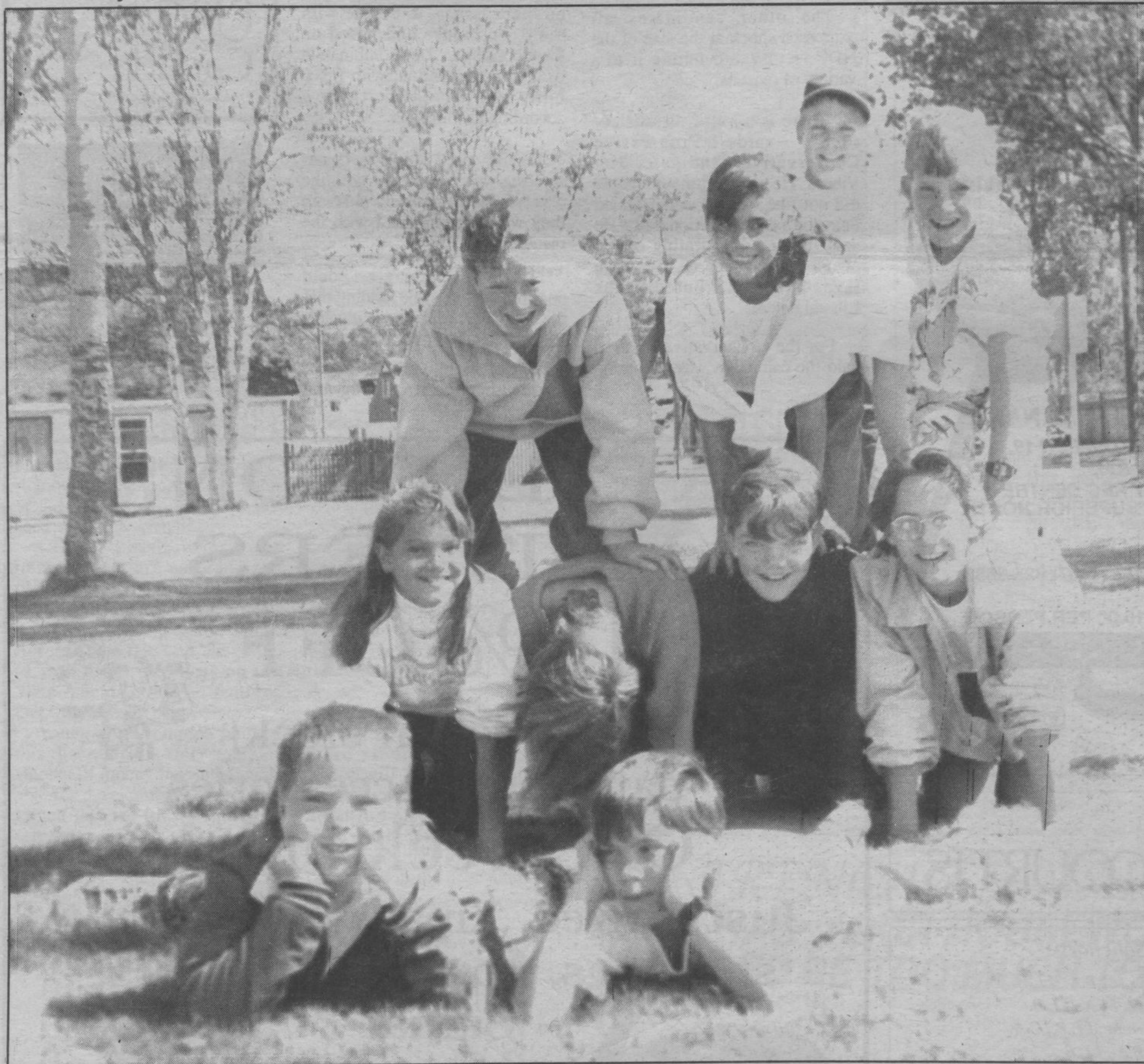
Students were ready to spring into action during the opening week of school.