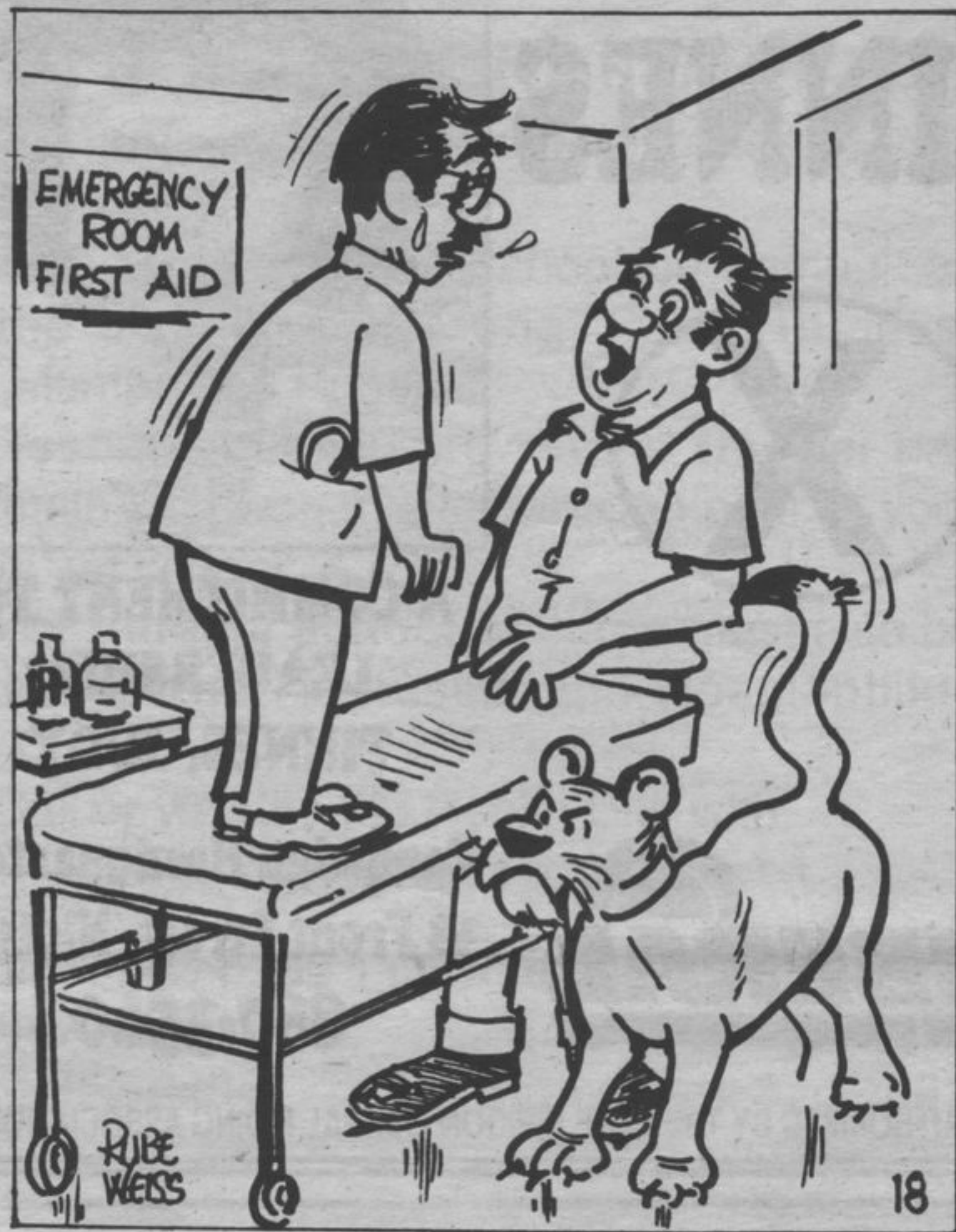
"I HATE TO ASK THIS, BUT OUR VET IS OUT OF TOWN AND..."