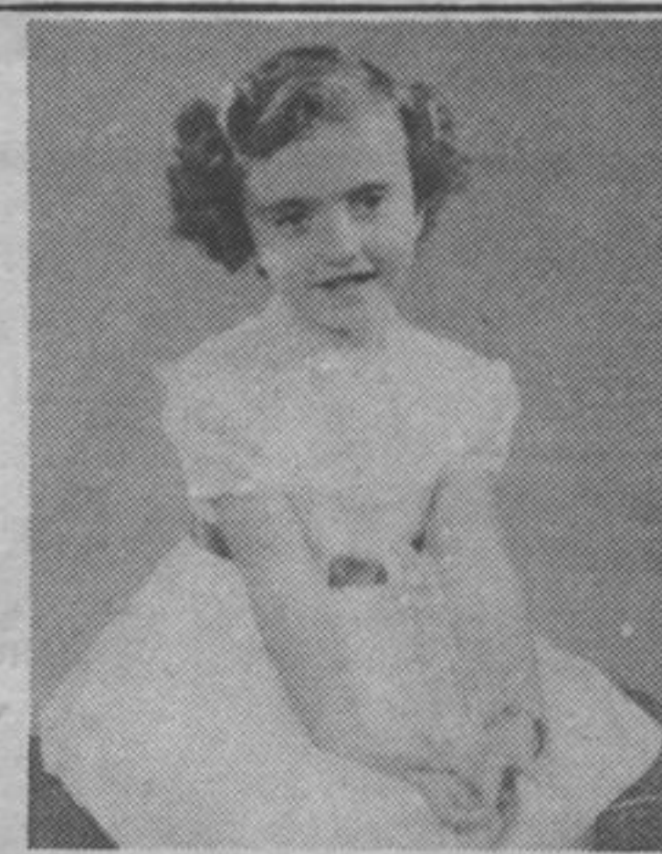
LORDY, LORDY ANOTHER BANKER IS 40! HAPPY BIRTHDAY