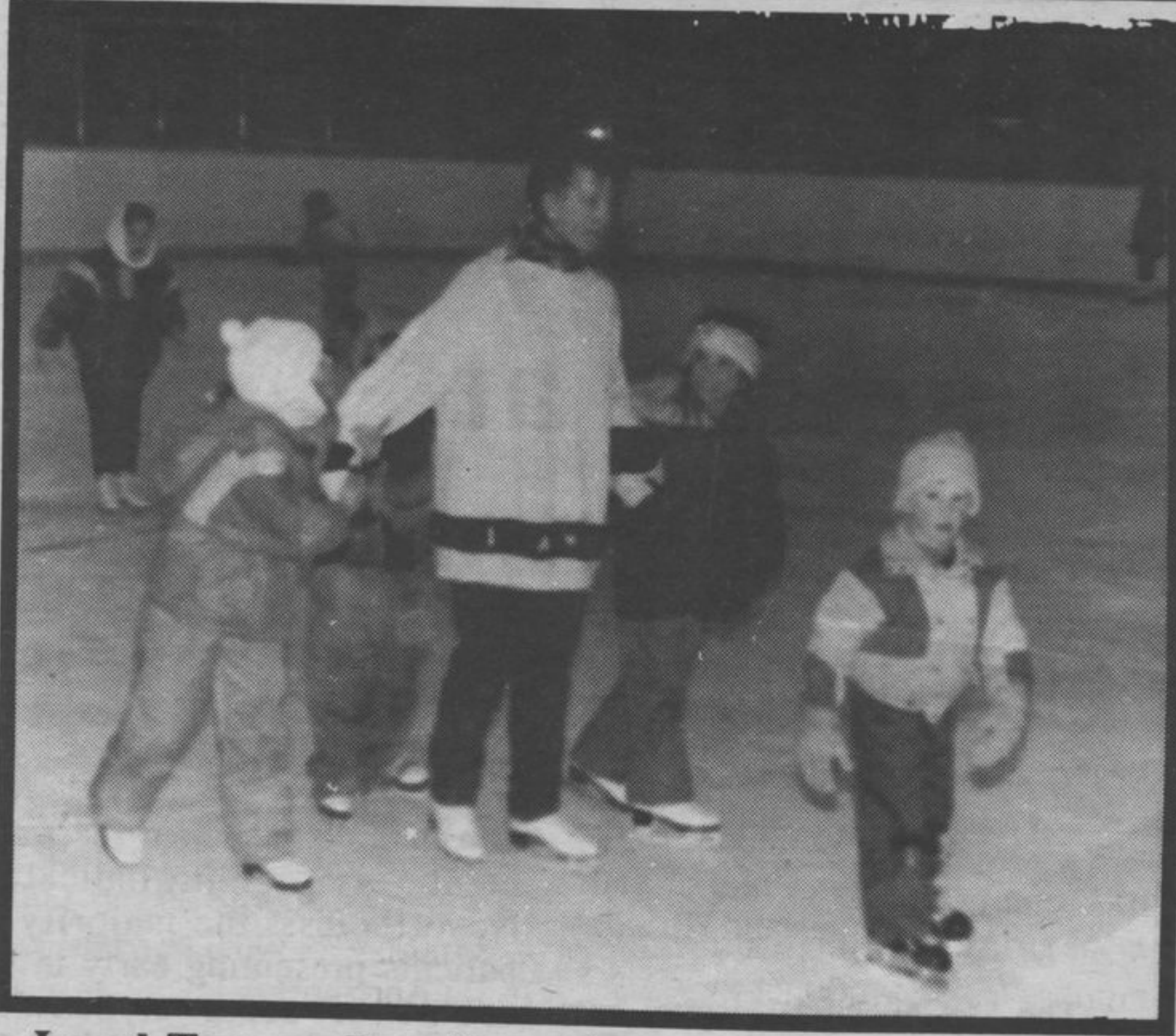
Local Terrace Bay Brownies spend an evening out at the arena. After strenuous skating they were served hot chocolate and muffins.