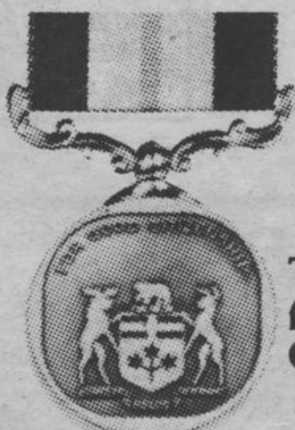
The Ontario Medal for Good Citizenship

We need your nominations by March 15, 1990. Nomination forms are available now by writing: The Ontario Honours and Awards Secretariat, Ministry of Intergovernmental Affairs, 6th Floor, Mowat Block, 900 Bay Street, Toronto M7A 1C1 or from your M.P.P.'s constituency office.