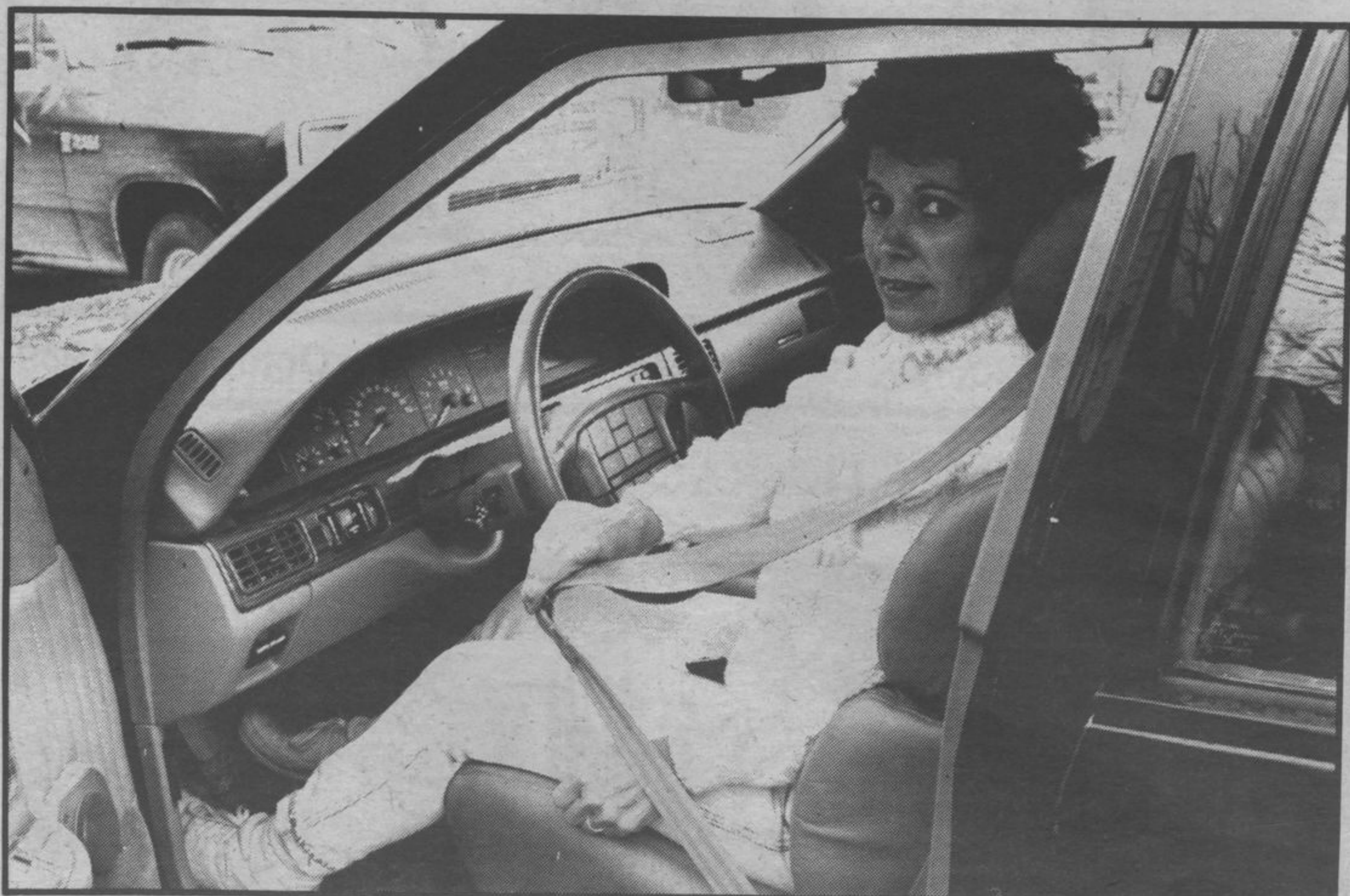
Even for short trips in town, it's safer to buckle up. It can also save you a $53 fine.