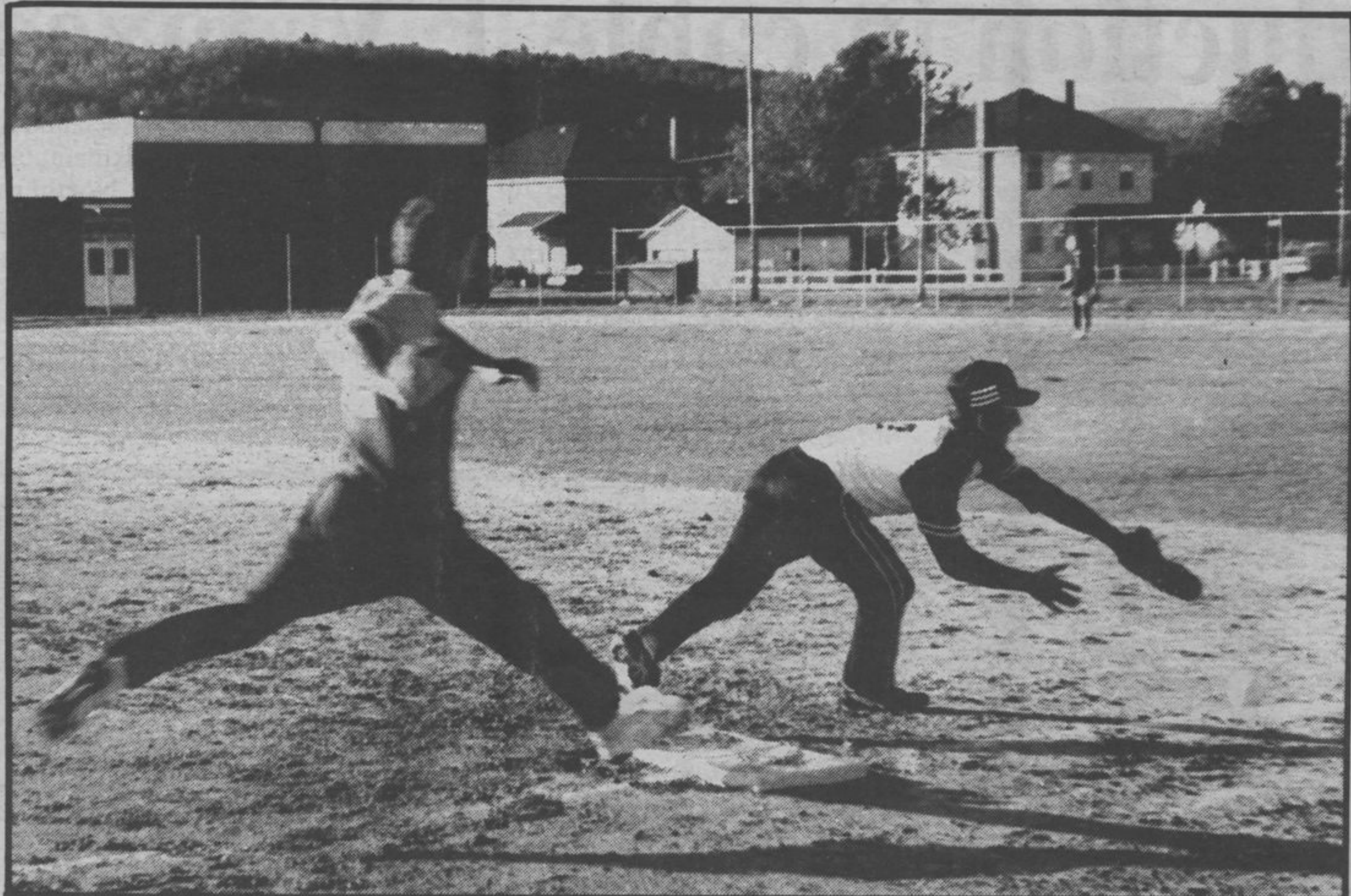
The Sabres took first place in this year's Men's Slow Pitch Tournament beating out the I-Team by a score of 17-10. Above is action from the last regular season game of the year between the Sabres and the Expos. Final Standings for the year are on page 6.