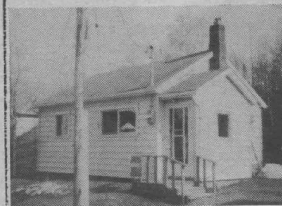
114 Galena Street, Schreiber FRIENDLY LITTLE HOUSE

They'll love this attractive 3 bedroom bungalow. Located in the new subdivision, nice lot, only 5 years old. Call now for an appointment. $87,900.00