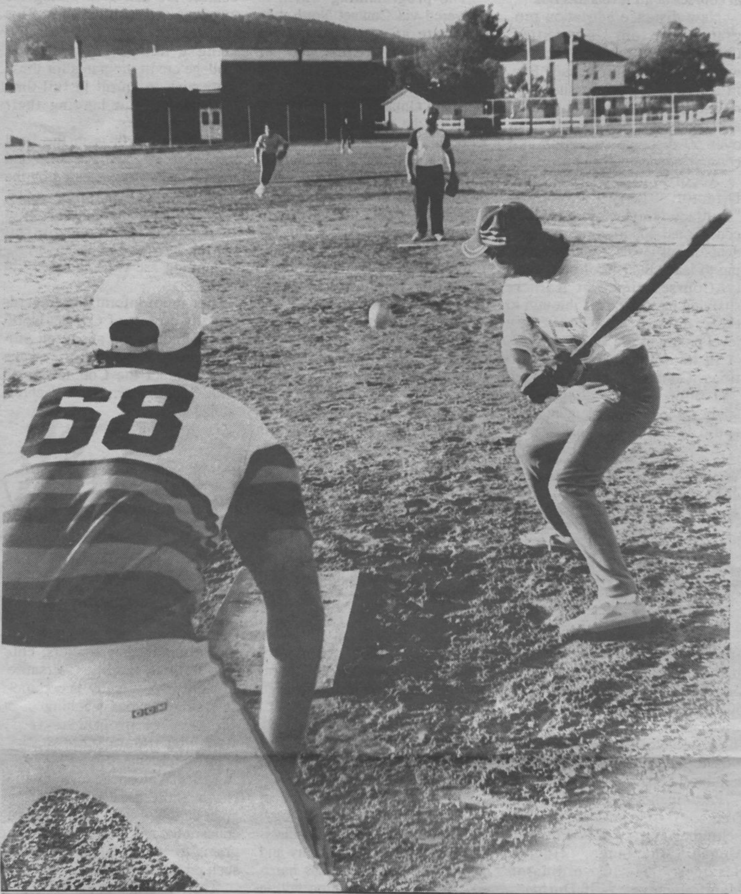
The Schreiber Men's Slowpitch League's season wound up last Wednesday evening. Above, a Sabres player prepares to make contact with a nice pitch. Sabres won the game, beating the Expos 25-12. The Men's slowpitch tournament was played last weekend. Watch for the results in next week's paper.