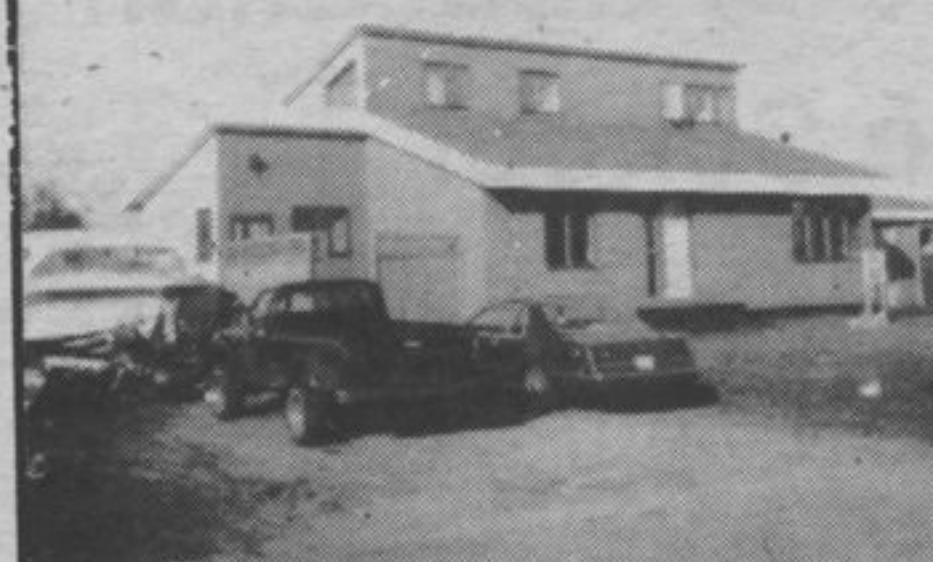
33 Southridge, Terrace Bay

So many extras to be found in this 3 bedroom, 2 storey home. Built-in oven, counter top elements, dishwasher and attached garage. This and more for only $98,900.00!