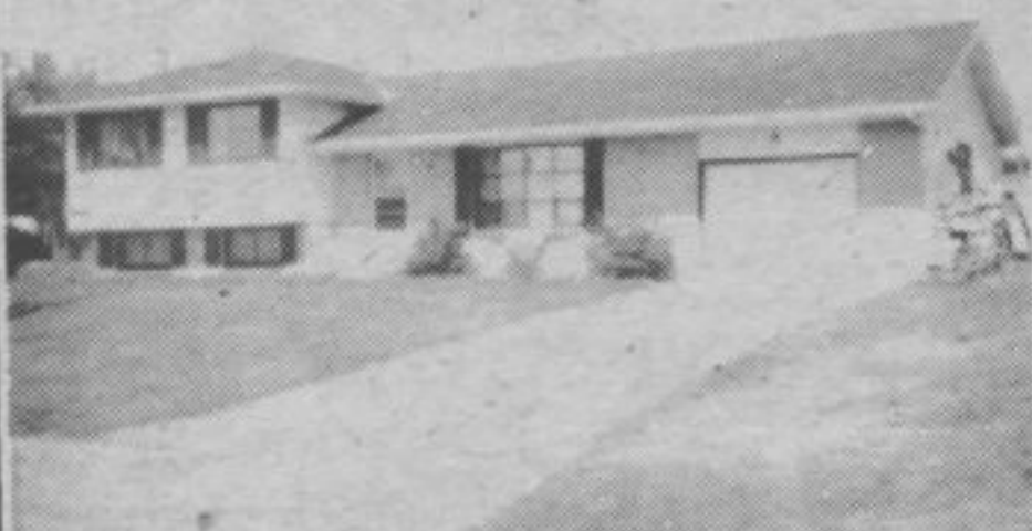
10 East Grove Court, Terrace Bay

Simcoe Plaza - P.O. Box 715 Terrace Bay, Ont. P0T 2W0 Office - 825-9393 or - 825-3221