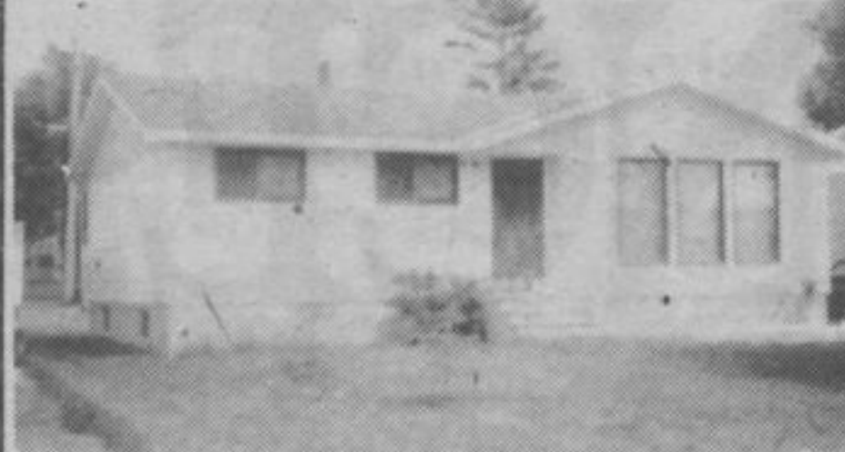
625 Strathcona Ave., Terrace Bay FRIENDLY HOUSE

Simcoe Plaza - P.O. Box 715 Terrace Bay, Ont. P0T 2W0 Office - 825-9393 or - 825-3221