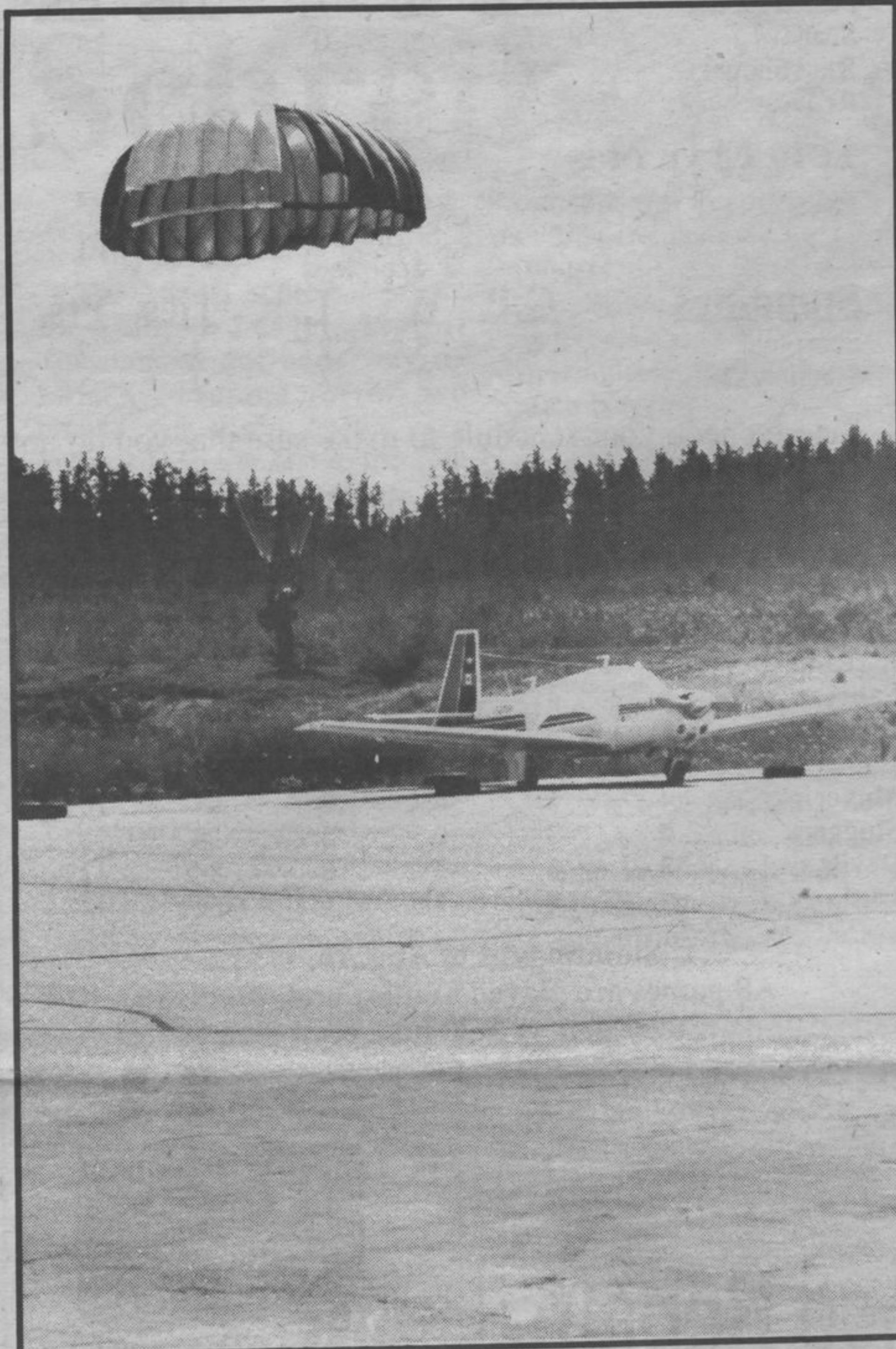
Master Corporal Marty Maloney touches down just off the tarmac at the Terrace Bay Airport after jumping out of a CC115 Buffalo during a Search and Rescue practice.

The 424 Squadron's other primary role of light transport, over the years, has seen taskings including disaster relief flights to Lima Peru, and Mexico City; support of the UN Emergency Force