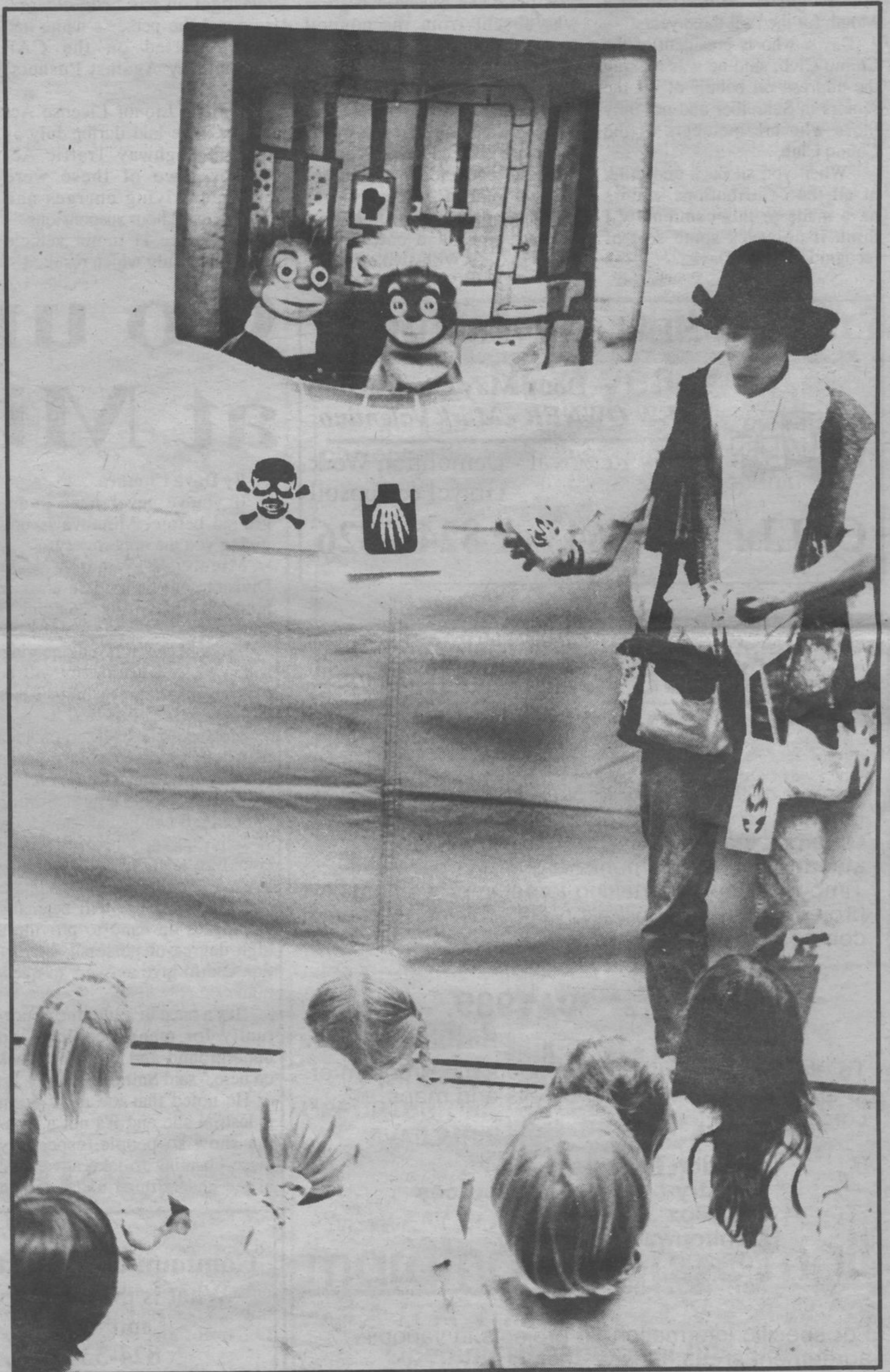
Terrace Bay Summer Playground tots were treated to a puppet show last Wednesday at the Terrace Bay Library. The show featured puppets Binkly, Doinkel, Sniffer and their friend, Pockets. Although the children had fun and enjoyed the show, it was a serious message that was presented. The kids were taught the meaning of the four hazard symbols - flammable, corrosive, explosive and poisonous. Older people may recognize the puppets Binkly, Doinkel and Sniffer. They've appeared on television commercials in the past passing on the same message as the one given to the children.

Although time allotted by schools for such programs, and