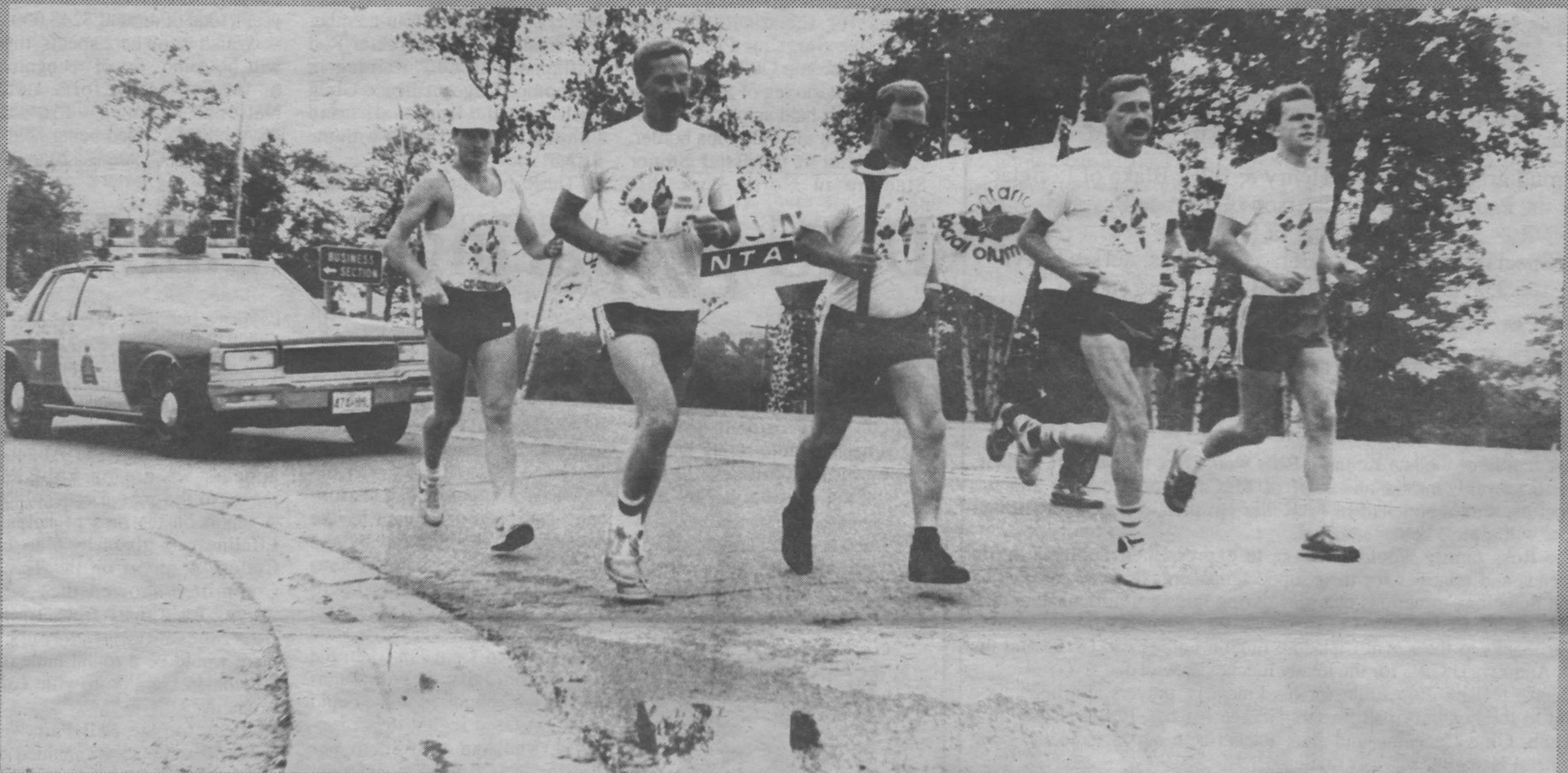
The OPP Special Olympics Torch Run passed through Terrace Bay and Schreiber last Saturday morning. The run is being held to raise money for the Special Olympics and also to raise money towards programs for the disabled.