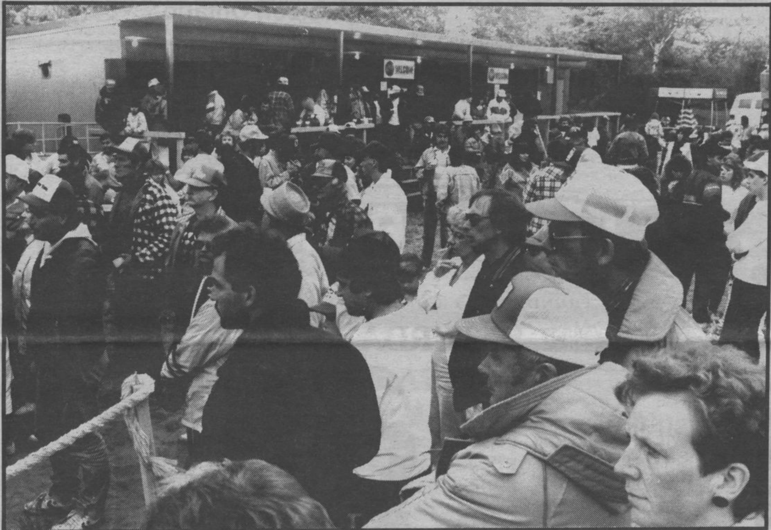
Crowds gathered as the weigh-in tables closed and the time to announce the prize winners approached.