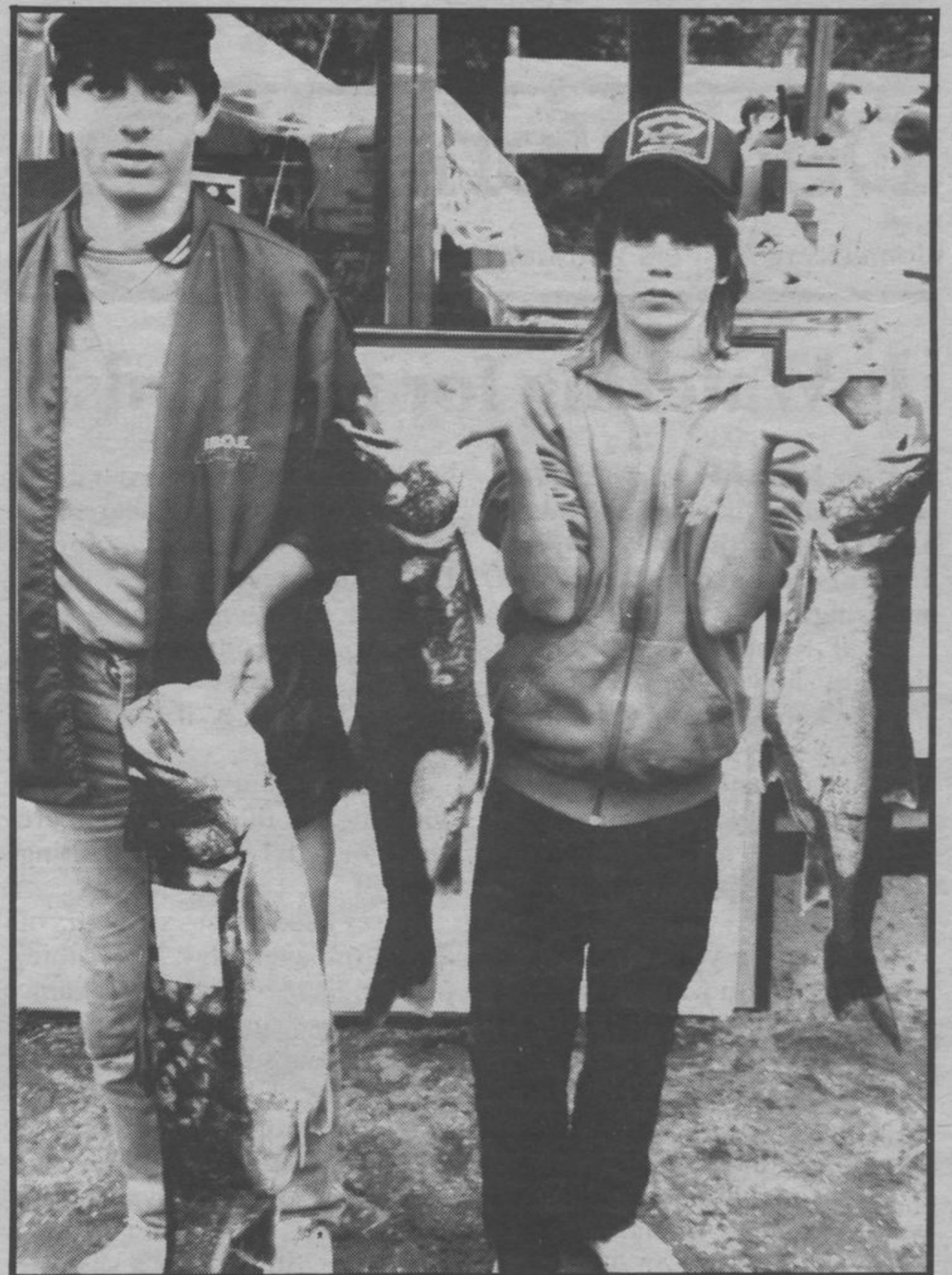
The second largest lake trout, 18.8 pounds, left, was weighed-in with less than half-an-hour before the weigh in tables closed.