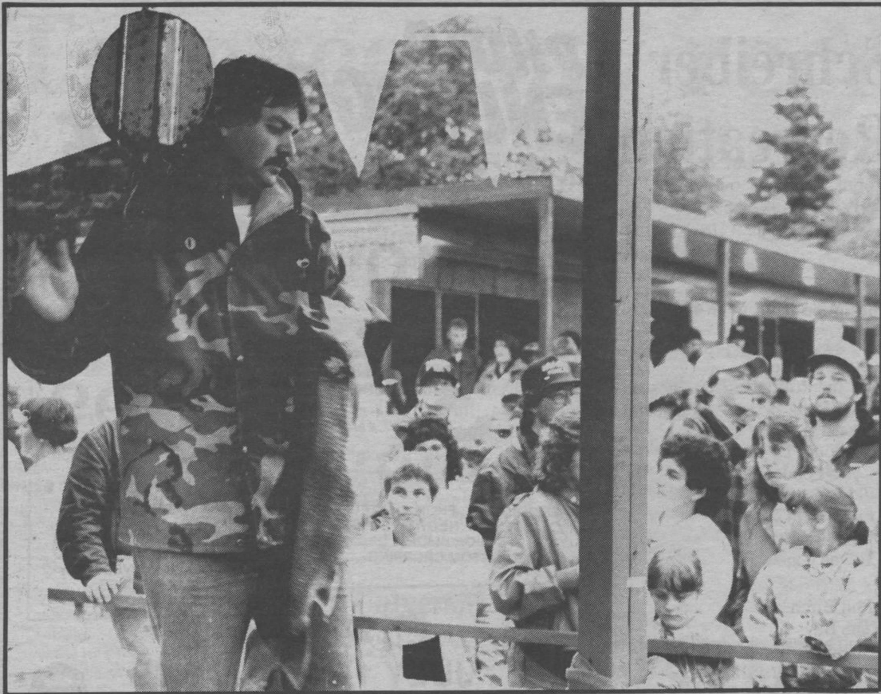
Spectators watch as a large lake trout is taken off the scales.