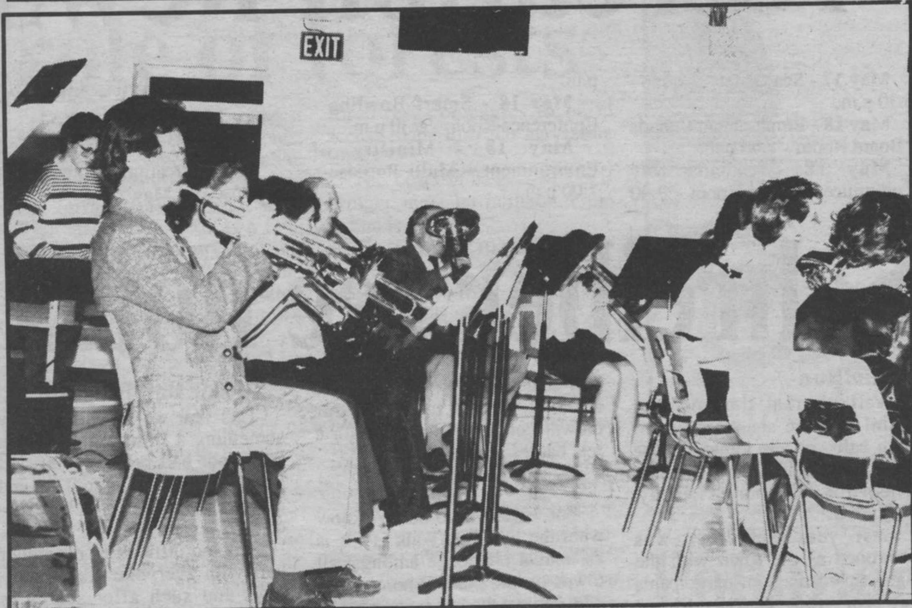
The Lake Superior High School Band and the Nor-Shore Community Band held a concert at the Lake Superior High School May 9. The concert included numbers ranging from classical to pop.