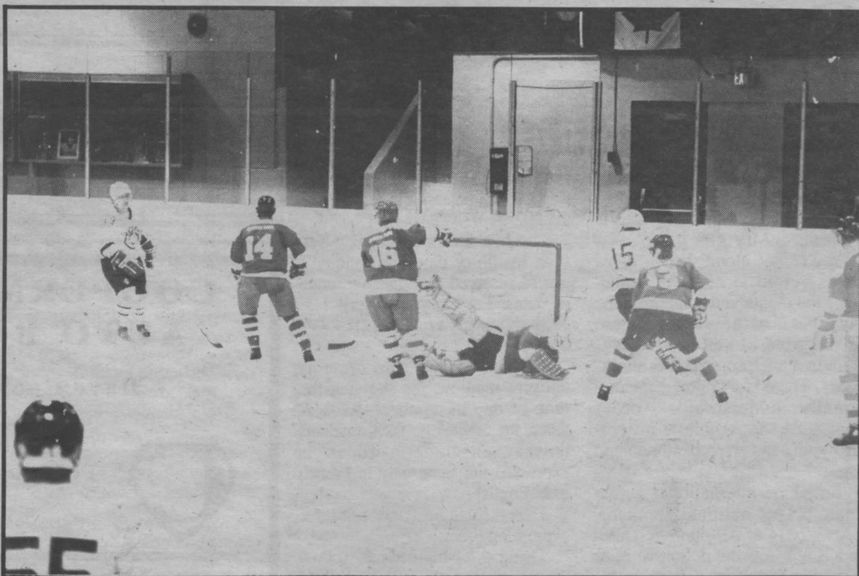
There was lots of end-to-end action during Thursdays action between the No Stars and the Canucks. Above, the No Stars goalie makes a save but the Canucks won the game 5-2.

Remember provide food, water shelter, exercise and affection and you'll have a happy dog.