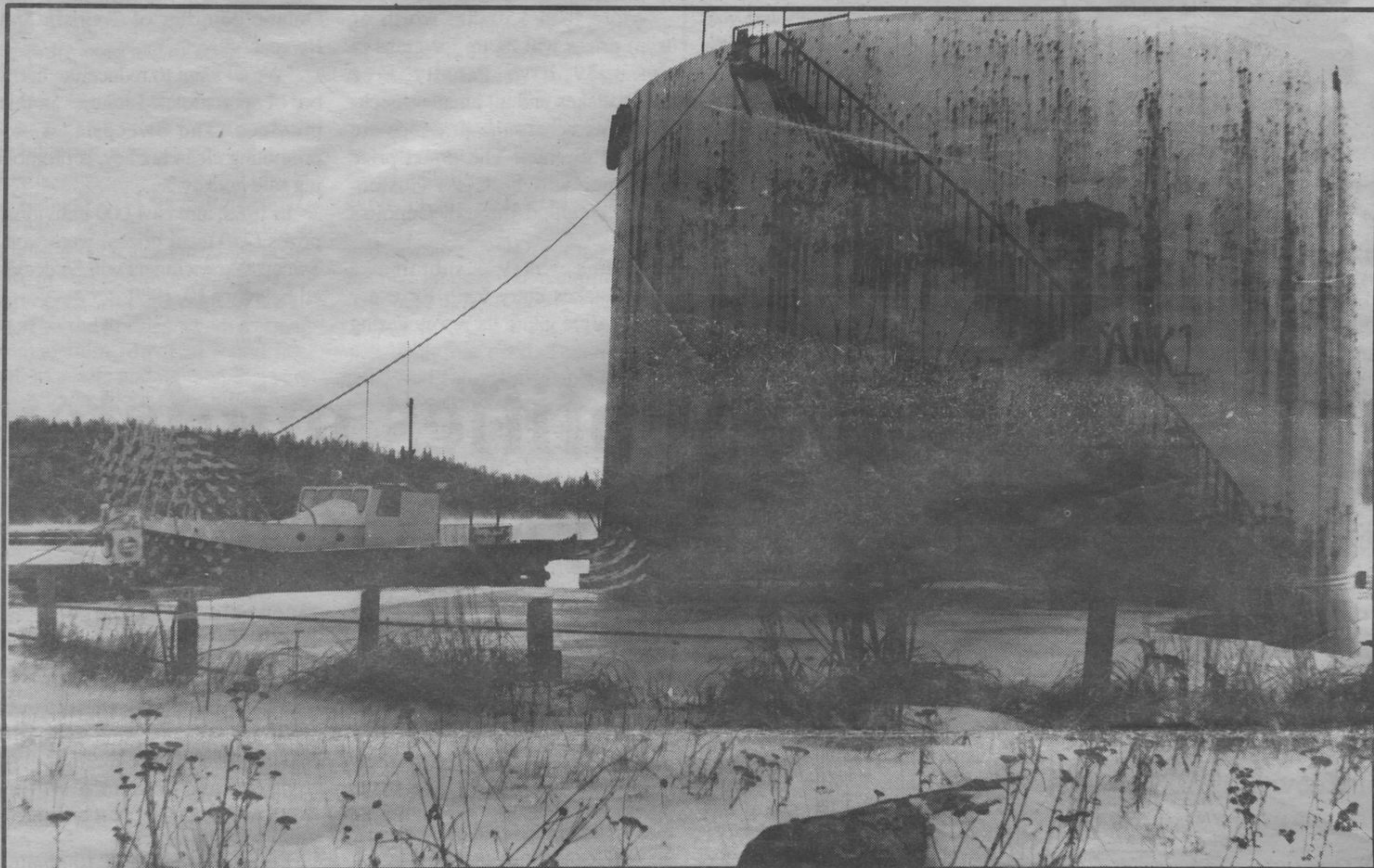
The oil tank shown above dwarfs the boat next to it. The tank was left at the RosSPORT dock two months ago after the company towing it encountered a storm. The owner of the tug boat that left the tank in RosSPORT is now frozen in in Sault Ste. Marie.