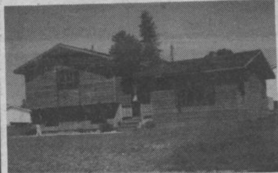
43 East Grove, Terrace Bay RELAX...ENJOY

Simcoe Plaza - P.O. Box 715 Terrace Bay, Ont. P0T 2W0 Office - 825-9393 or - 825-3221