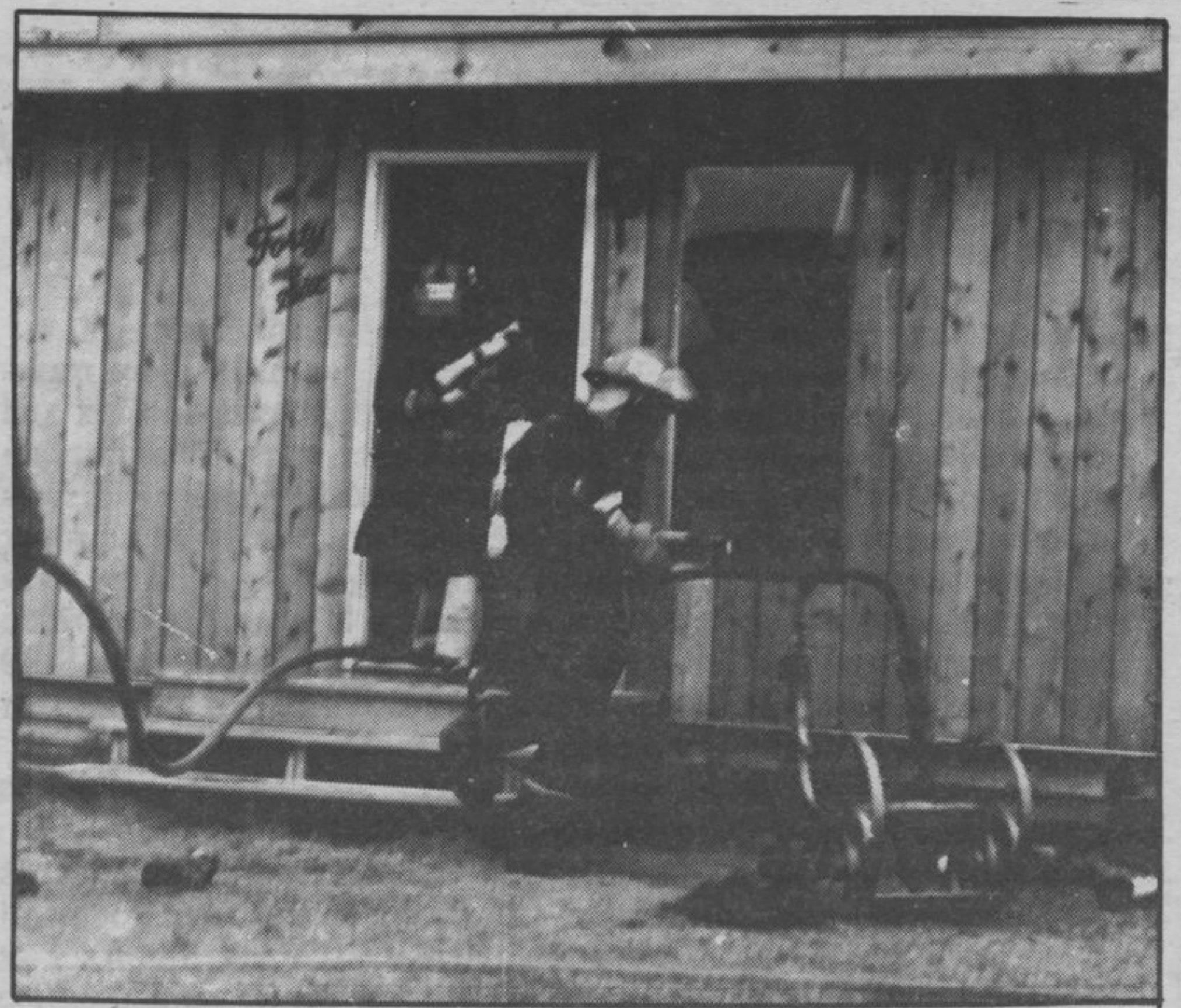
Terrace Bay firefighters responded to a house fire on Southridge Crescent last week. There were no reported injuries, and damage was mostly caused by smoke.

Coffee was served before the evening concluded. Everyone is welcome to the next meeting in the McCausland Hospital on November 17 at 7.00 p.m.