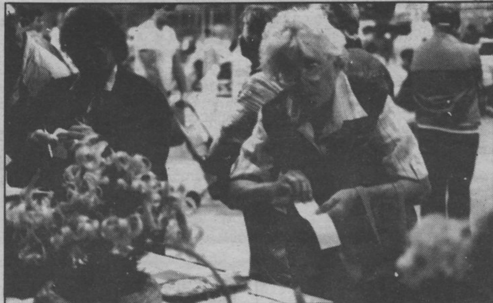
Raffles were a popular attraction for many Fall-goers.

The bowling fee will again be $25, and it can be paid at the Terrace Bay Recreation Office. Bowling starts the first week of October.