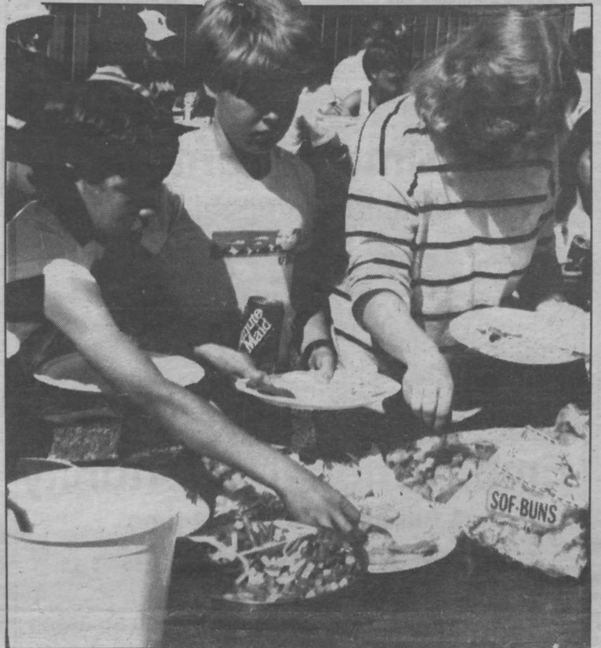
Leave some for me!: Although these young guests may not have fully understood the significance of the official opening of Minnova's Winston Lake Division Mine, they fully appreciated the delicious food that was served after the ceremonies concluded.