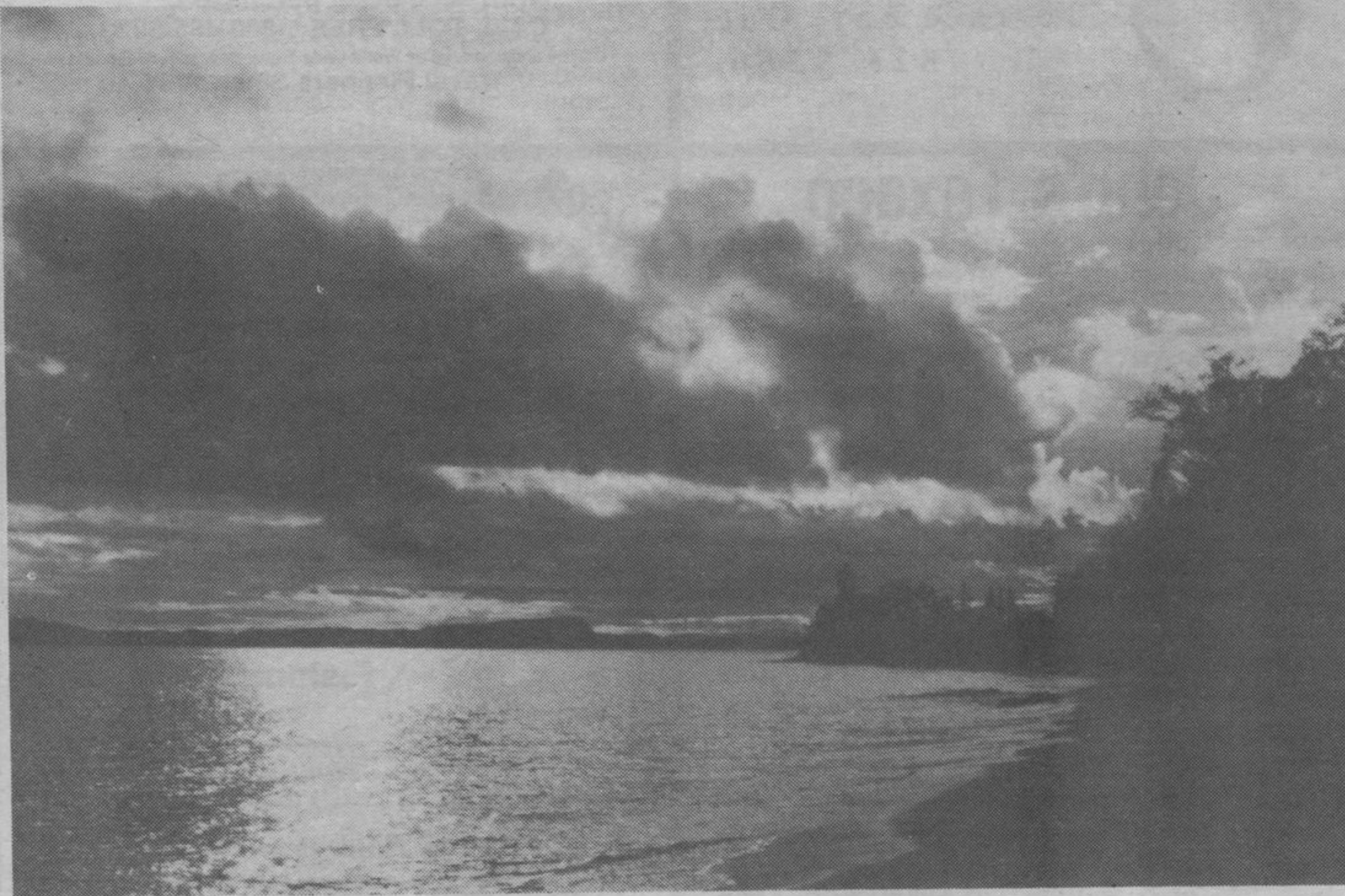
Cloud formations along the Lake Superior shoreline can provide stunning light effects for photographers. This picture was taken by Rosspport.