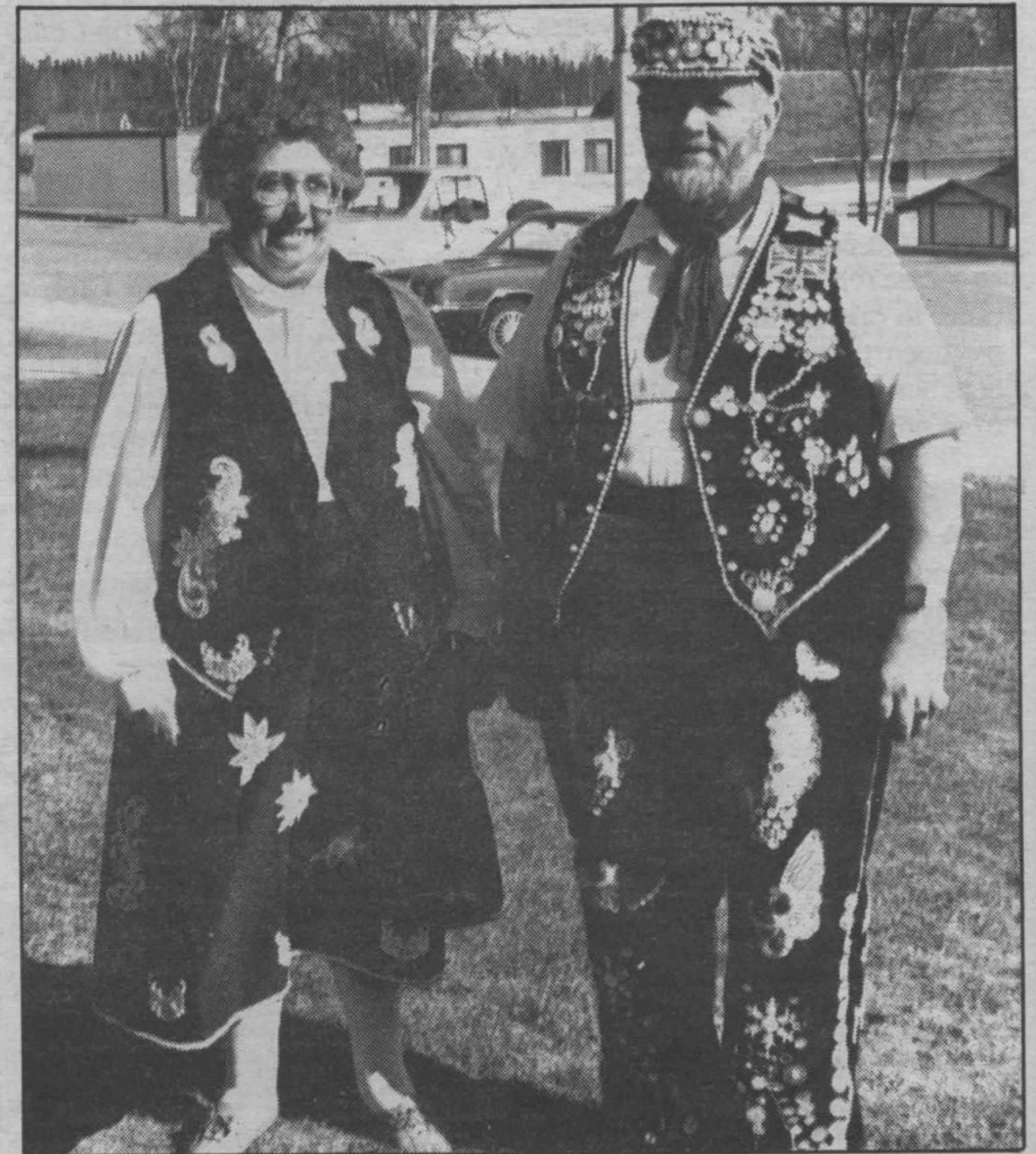
Sew...did that take a lot of work?

a great help to those whose native language is not English. The association is striving to provide language services to those who need it, particularly in legal or medical matters. See Sharing on page 13