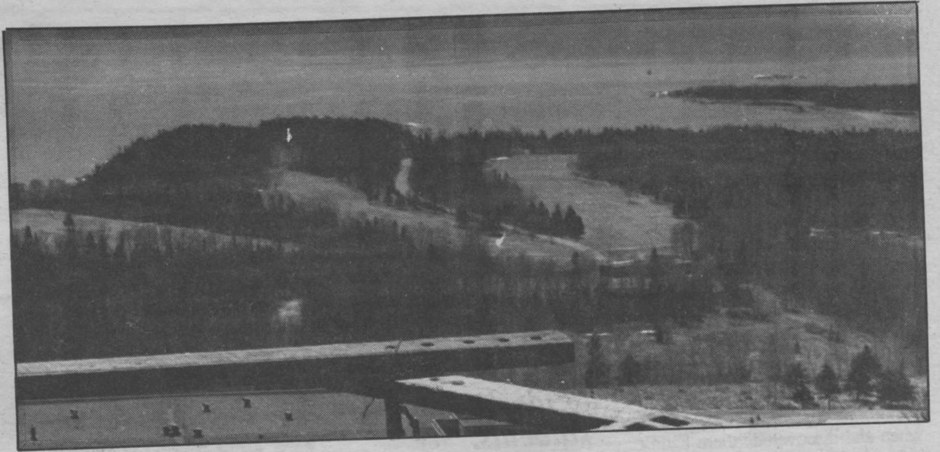
The chimney offered a spectacular view of the surrounding area. Golfing enthusiasts might want to commit this photo to memory for later

For the month of April, 58 occurrences were investigated.