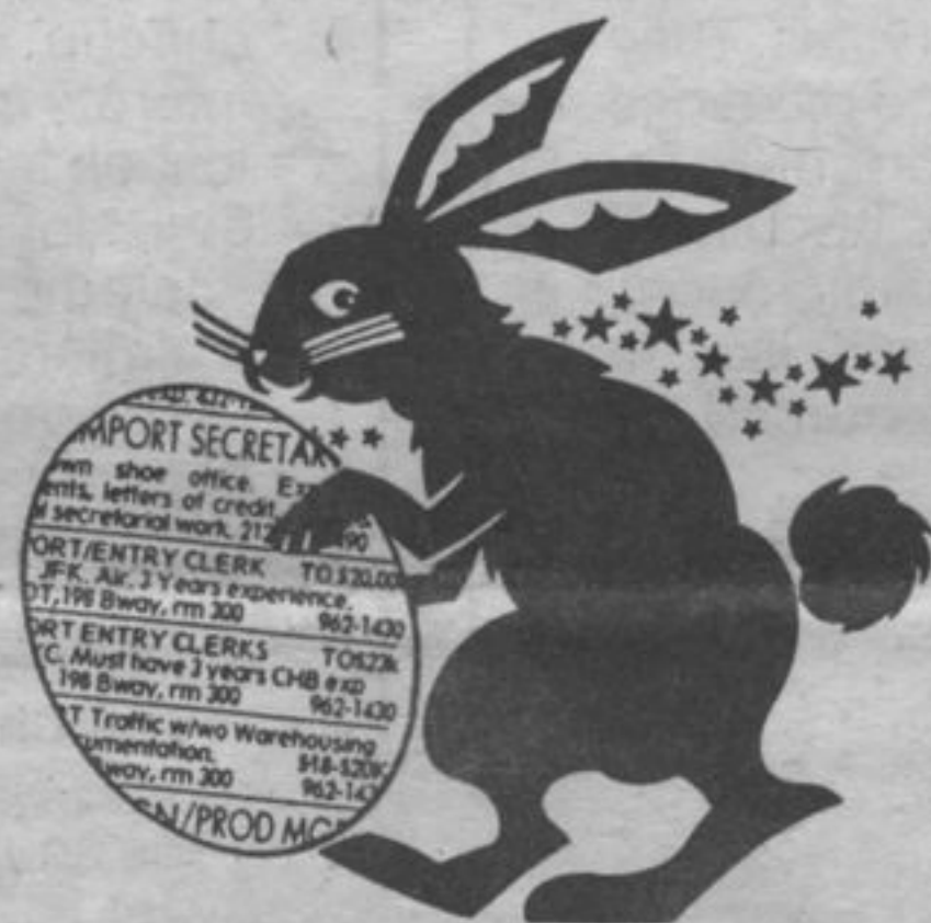
A Smart Easter Bunny Sells All His Eggs in the Classified Section.

Editor's note: Although it is the policy of the paper to publish letters to the editor accompanied with the author's name, it was deemed beneficial in this particular case to generate opinions and discussion without disclosing the author's identity.