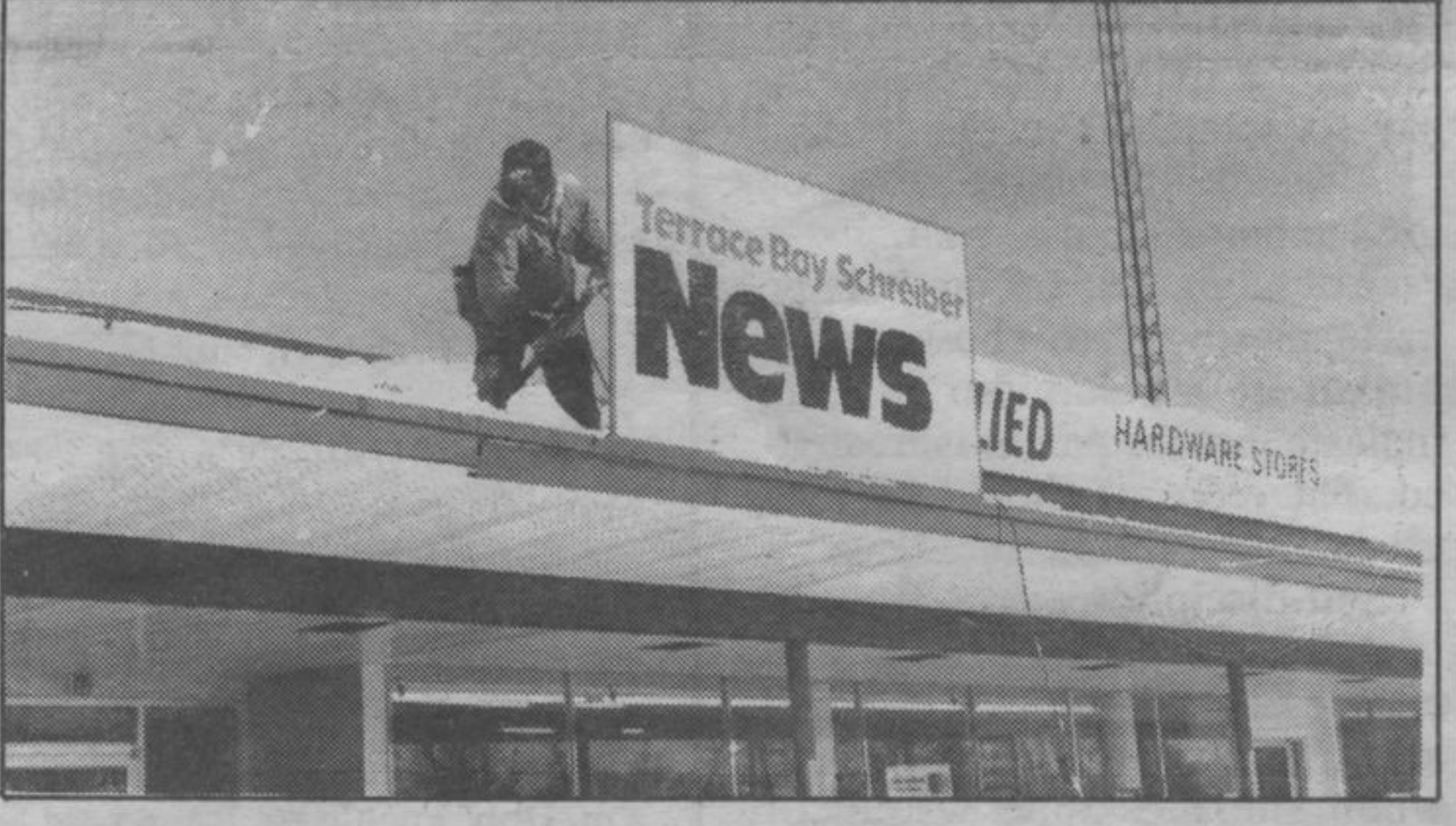
Sign on Simcoe Plaza

The Terrace Bay/Schreiber News office finally has a sign on the plaza. The sign, which went up last week, will let customers know exactly where the office is. People have told us that they were not quite sure where the office is; now there can be no doubt.