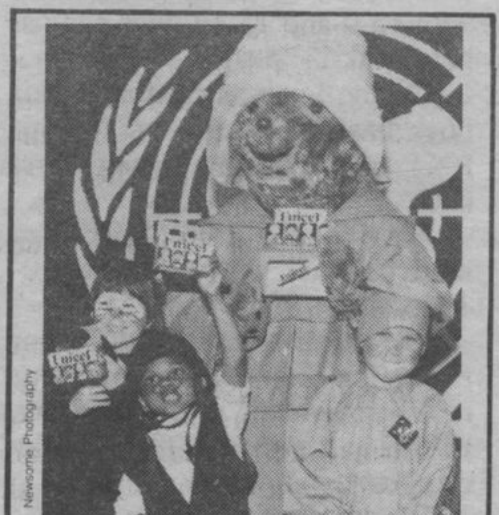
Paddington Bear and friends