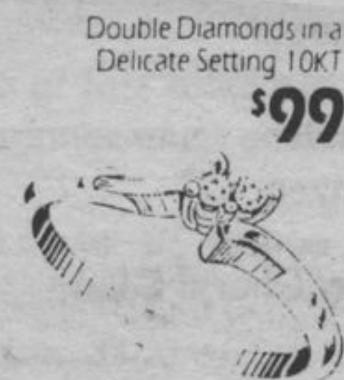
Double Diamonds in a Delicate Setting 10KT $99