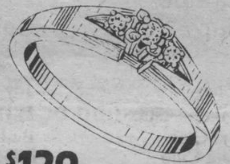
$129 Three Brilliant Diamonds Fashionably Set 10KT