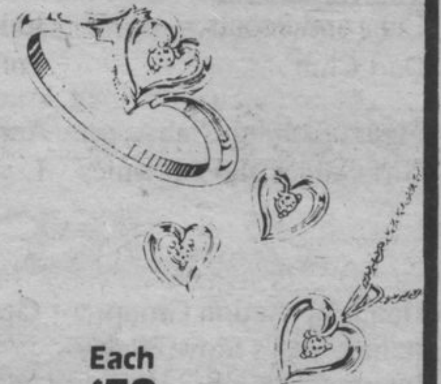
Each $79 Sparkling Diamond Accent Shining Hearts 10KT