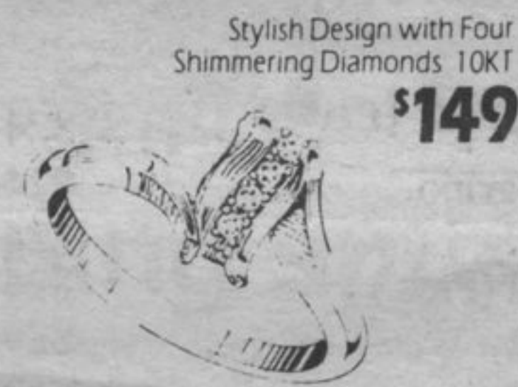
Stylish Design with Four Shimmering Diamonds 10KT $149