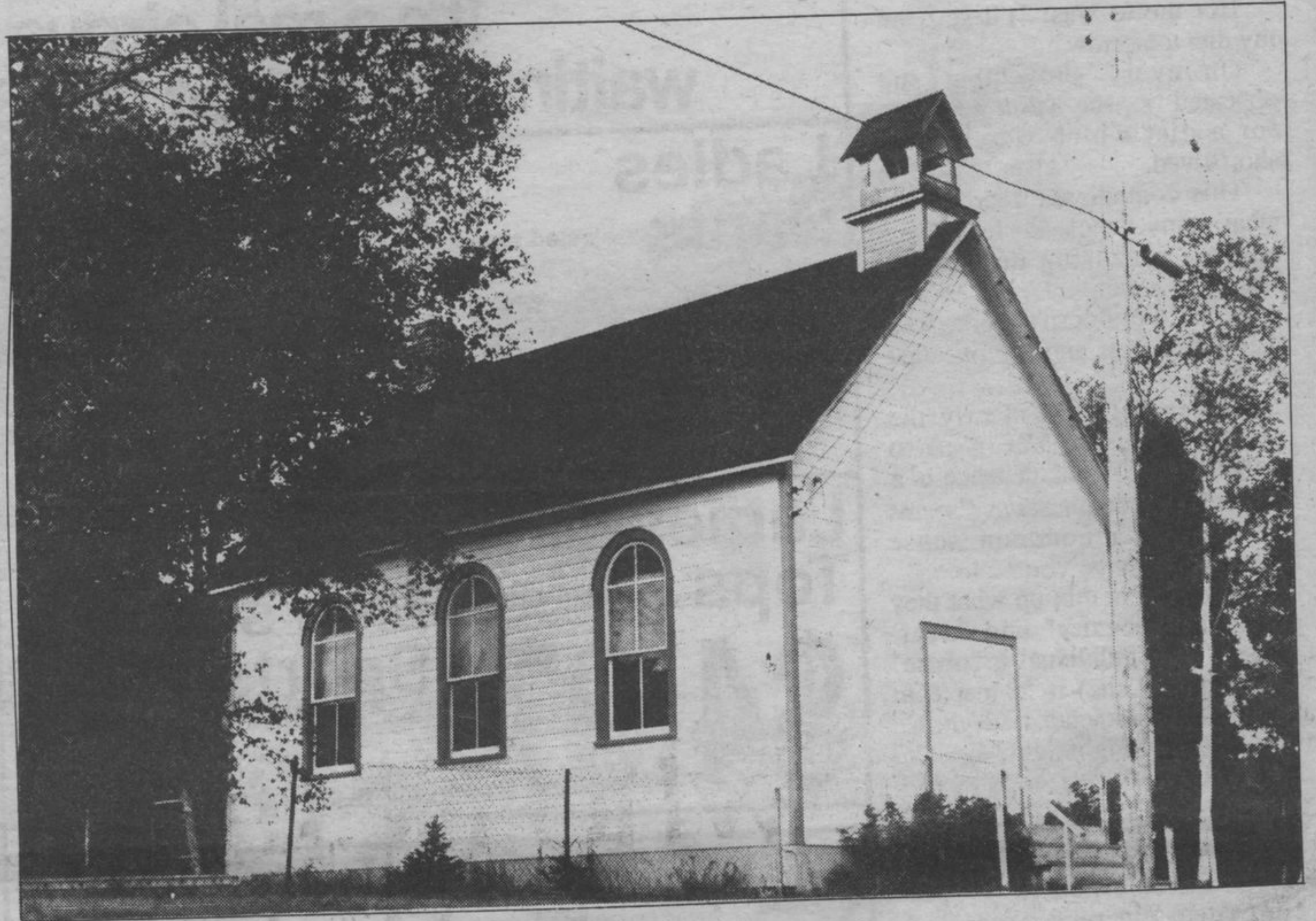
This is the Protestant Church in Rossport, Ontario.