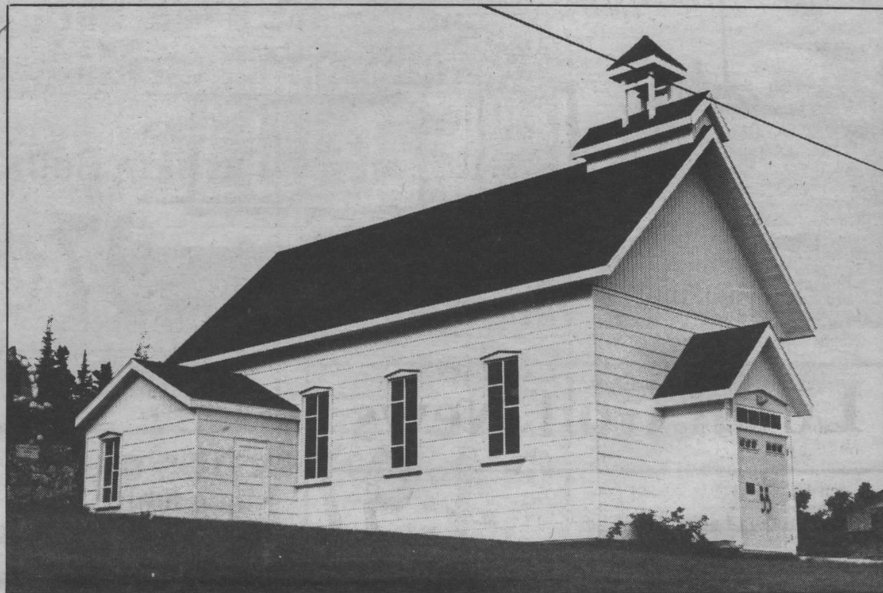
This is the Catholic Church in Rosspport. The original one burned down in 1924. It was built in 1881-82.